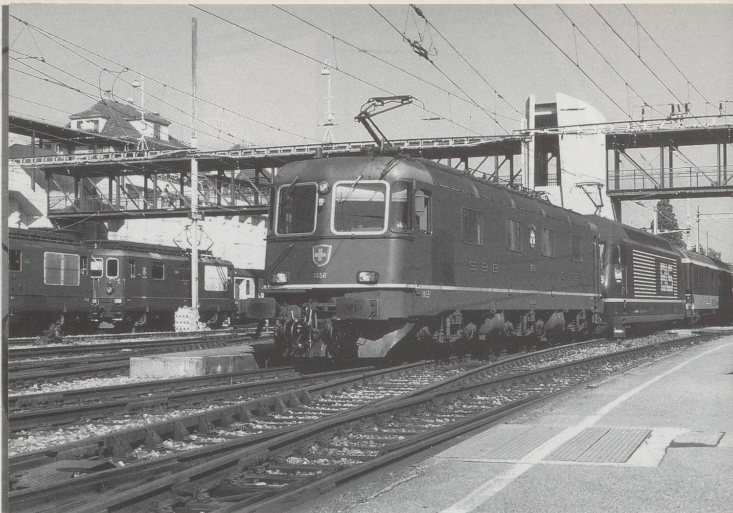
Above: Another view of the over bridge with older BLS Re4/4's on the left, SBB Re4/4 11650 & BLS Re465 008 with an Inter City train to Interlaken.

the cab of one of these locomotives. The comparison with other BLS machines is pointless. Ergonomically it is a vast improvement on the Re4/4's. There is even air conditioning in the cab! It is clear that the control panel has been designed to allow the driver to act quickly whilst at the same time not compromising his train. There is also a speed regulator which automatically applies the brakes if the locomotive is travelling too fast, and in common with other new locomotives, a large panorama window replaces smaller panels. The Re 465 also has adhesion grips between the bogies on each axle to prevent slipping in adverse weather.