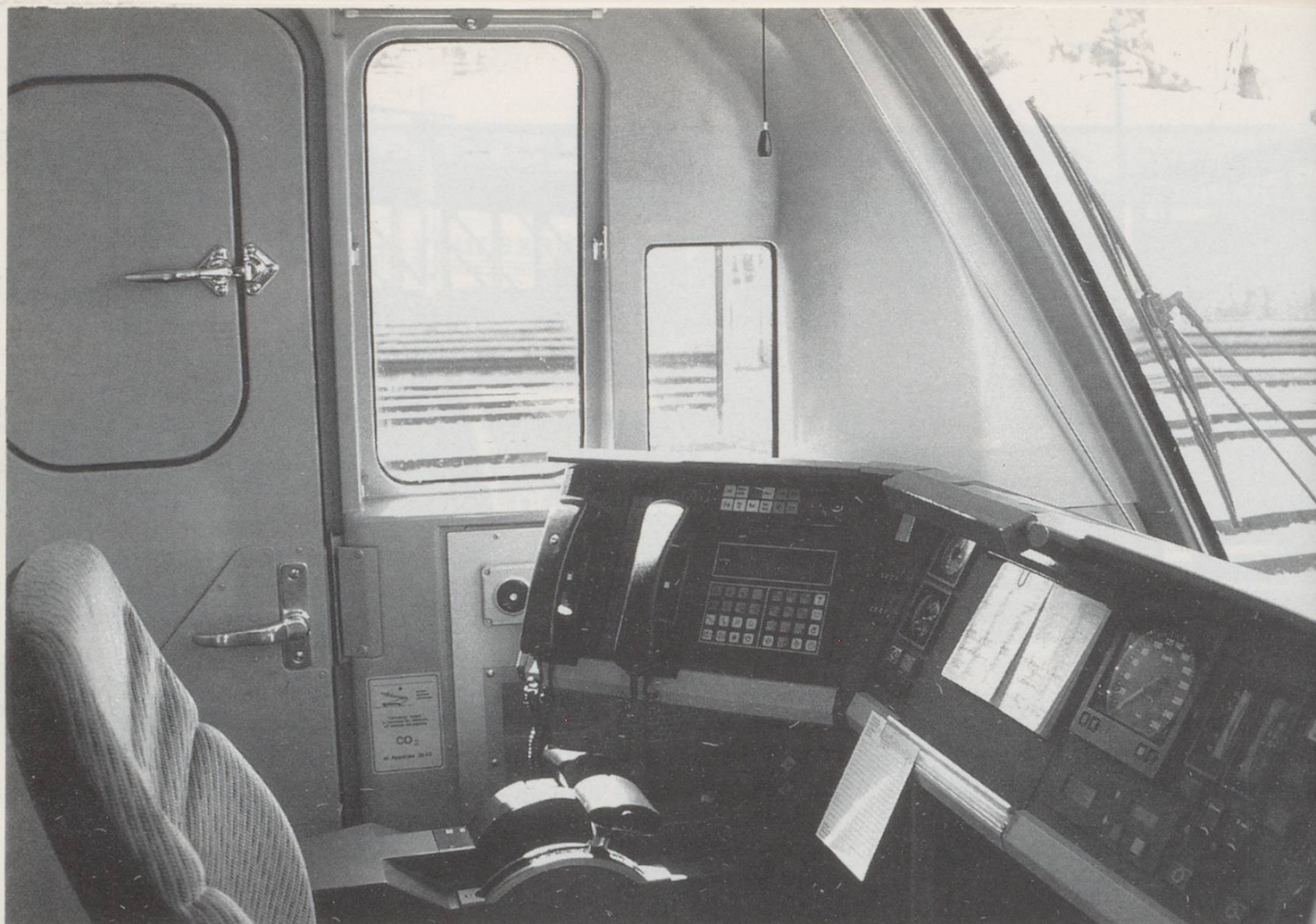
Previous page: Re465 001 with the new over bridge at Spiez station, you can have a clear view of the comings and goings across the whole station. Above: The drivers cab of an Re465.

3. Trains to Interlaken were also using Platform 2 using bi-directional signalling. The use of Platforms 4, 5 and 6 was unchanged. This arrangement does, however, cause scheduling problems. An example of this was that on numerous occasions, Brig bound services were held up while Regionalzugs from Interlaken to Zweisimmen crossed over the tracks to Platform 5. Track rationalisation is also taking place at the Thun end of the station. Eventually, Platform 2 trains from Interlaken to Bern/Basel/Zurich, Platform 3 trains to Brig, Platform 4 trains from Brig to Bern/Basel/Zurich and Platform 5 trains to/from Zweisimmen. A feeder line will take trains from Interlaken to Zweisimmen across the station to access the correct platform. There will also be a crossover to enable trains to/from Brig to access either Platform 3 or 4.