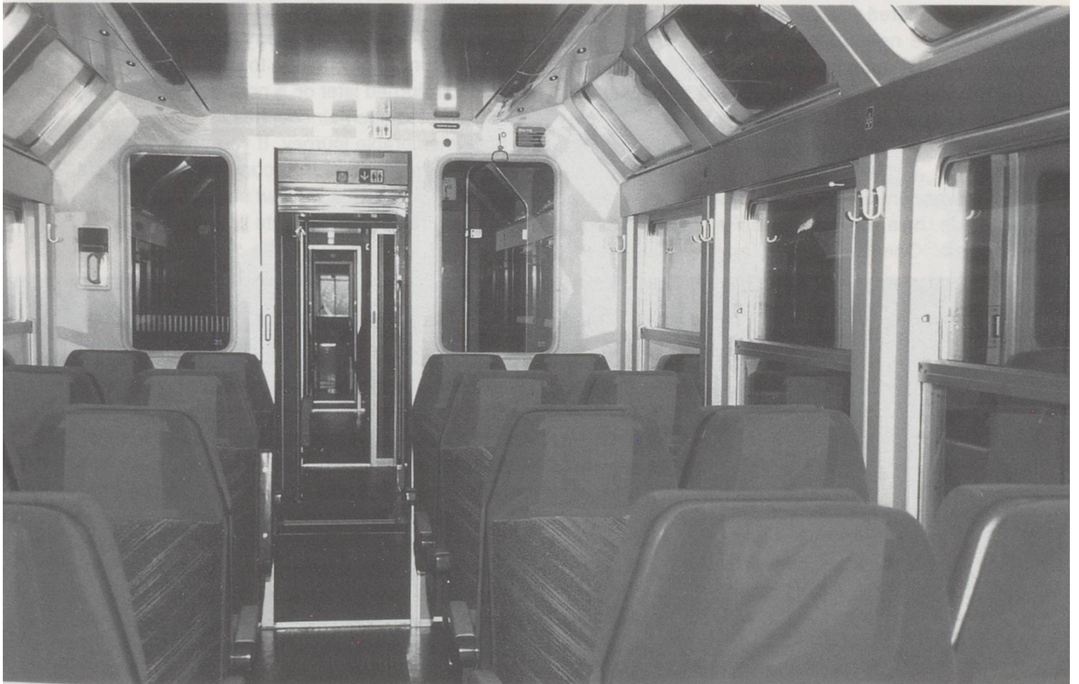
Opposite page: No.15 passing the front of Martigny station. Bt51 running to Vernayaz. Above & Below: Interior views of the new 2-car sets.