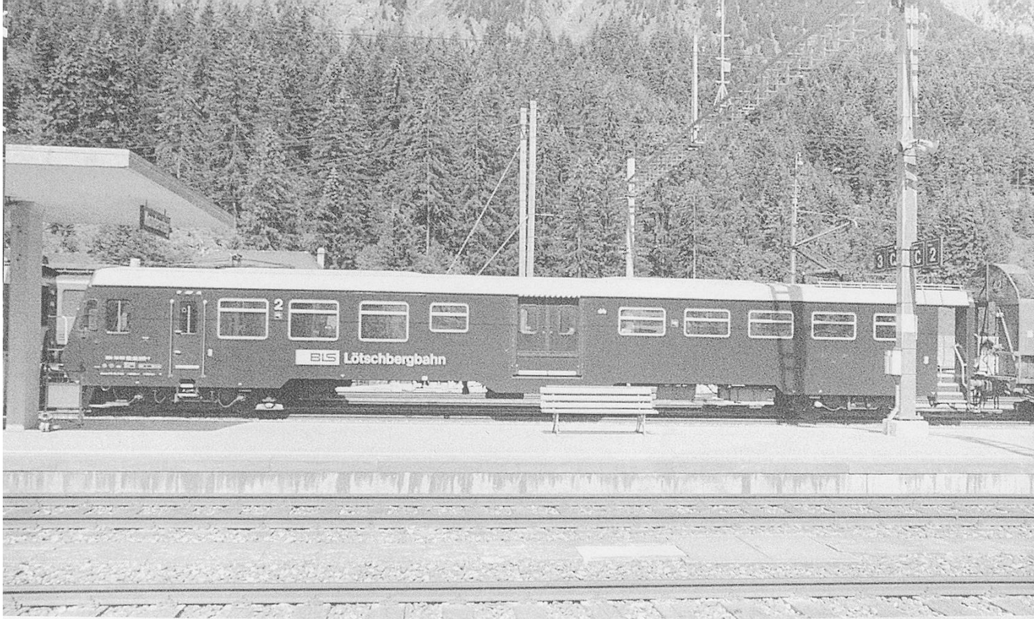
New BLS car-carrier Bt driving trailer.

ter trains. I thought the livery far from striking.