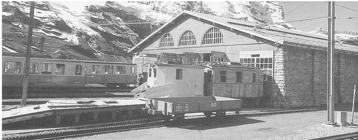
Jungfrauabahn sheds at Kleine Scheidegg, with snowplough and early locomotive "on shed".