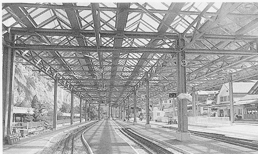
The new Wengernalpbahn train shed at Lauterbrunnen Swiss Express Vol.4/1 March 1994

A trip to Kandersteg took up the sixth day. This gave us a view of the fairly new end coaches for the Lötschberg tunnel car transpor-