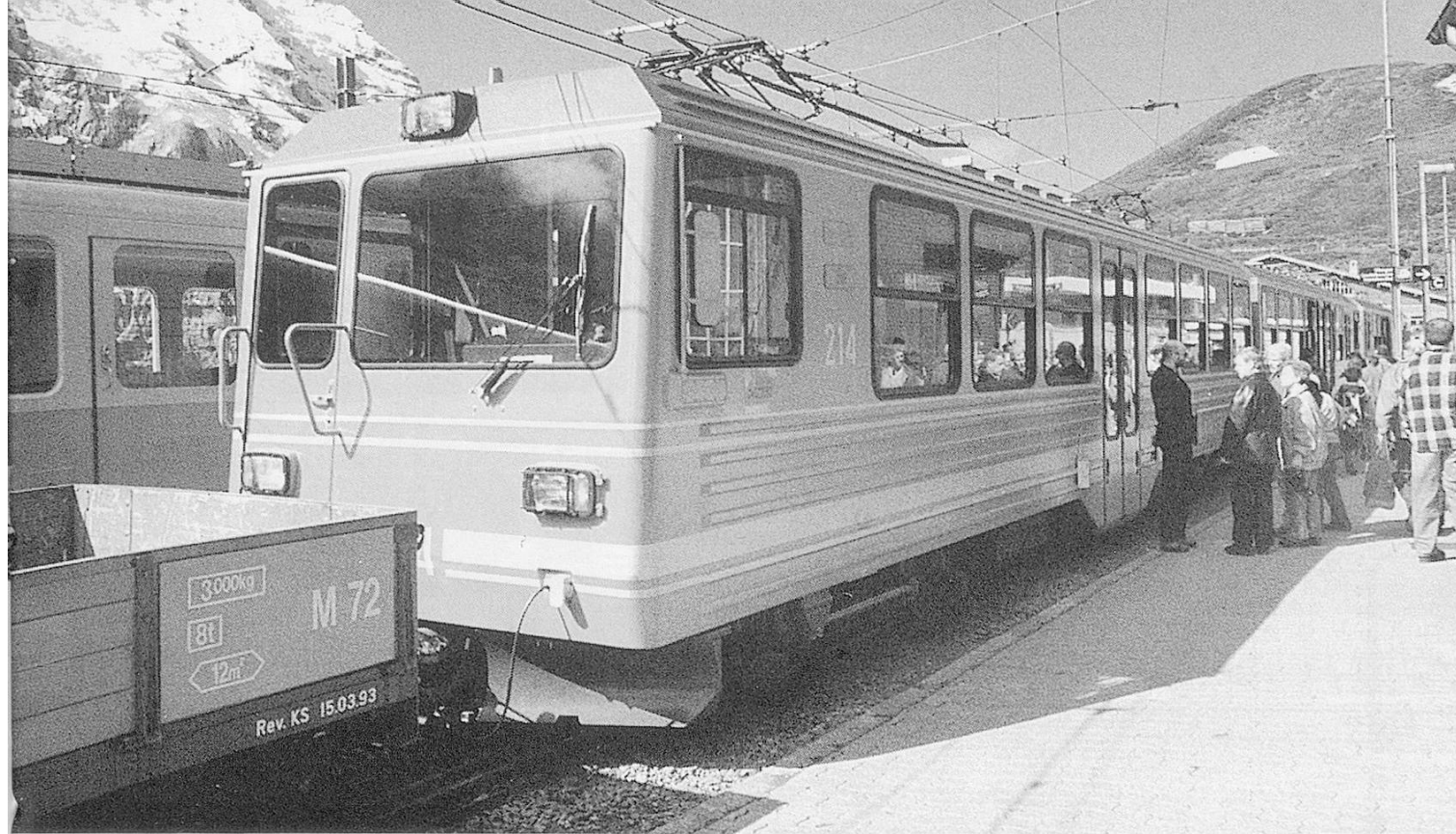
Jungfrauabahn Bhe4/8 No.214 at Kleine Scheidegg.

On the third day we decided to go over the Brünig pass. We caught the usual BOB train into Interlaken Ost where we changed to the SBB's only metre gauge route. On the approach to Meiringen I noticed an old Appenzeller Bahn locomotive tucked behind one of the sheds. I'm not sure what it was doing there and unfortunately I was unable to take a photograph. On the return trip we had time to kill at Meiringen. The expected tramcar had vanished from the Innertkirchen line, in its place BOB Triebwagen No.301 was being used as a solo unit. We took to the water at Brienz, a lake trip is as much a must and when it's on P/S Lötschberg , well it's history.