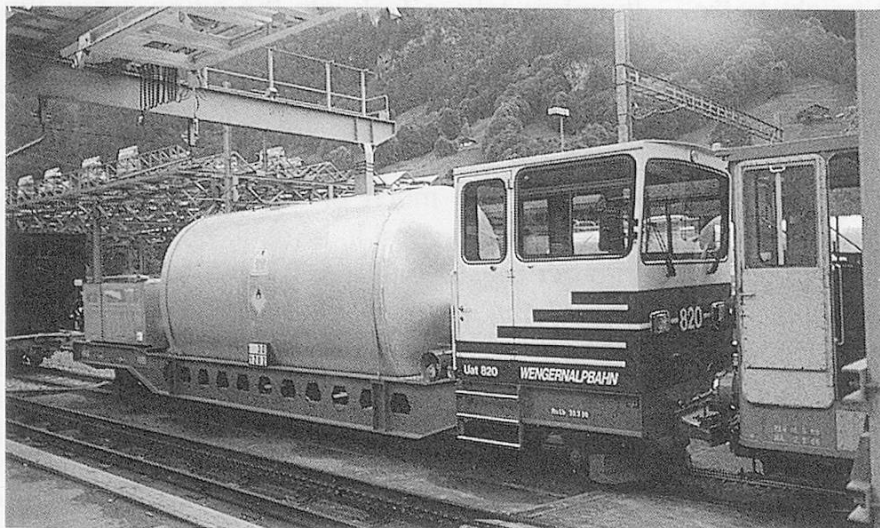
Wengernalpbahn Uat No.820 at Lauterbrunnen

On the second day we took the trip to Schynige Platte. It started well, but when we reached the summit the weather had closed in. At Wilderswil I noticed the new coaches and He2/2 No.16, painted in over-all red, very striking and smart. For these jaunts I find the regional pass invaluable supplemented, if one has a family, by the family card.