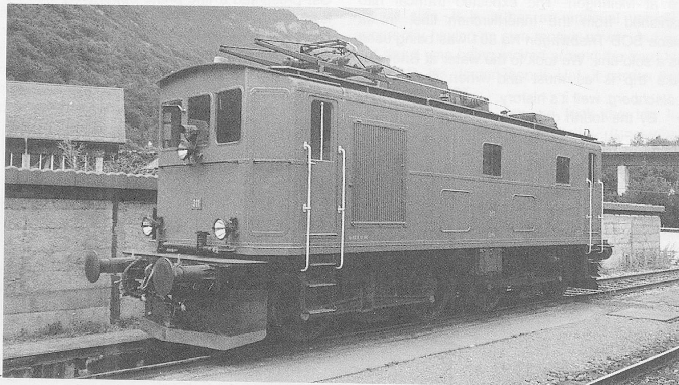
BLS Ce4/4 No.311 at Interlaken Ost.

The mathematical conundrum commented on in the September 1993 Swiss Express was also very much in evidence in the shape of a large poster outside the station. All good things have to come to an end, so did our holiday, and it was back to the UK again.