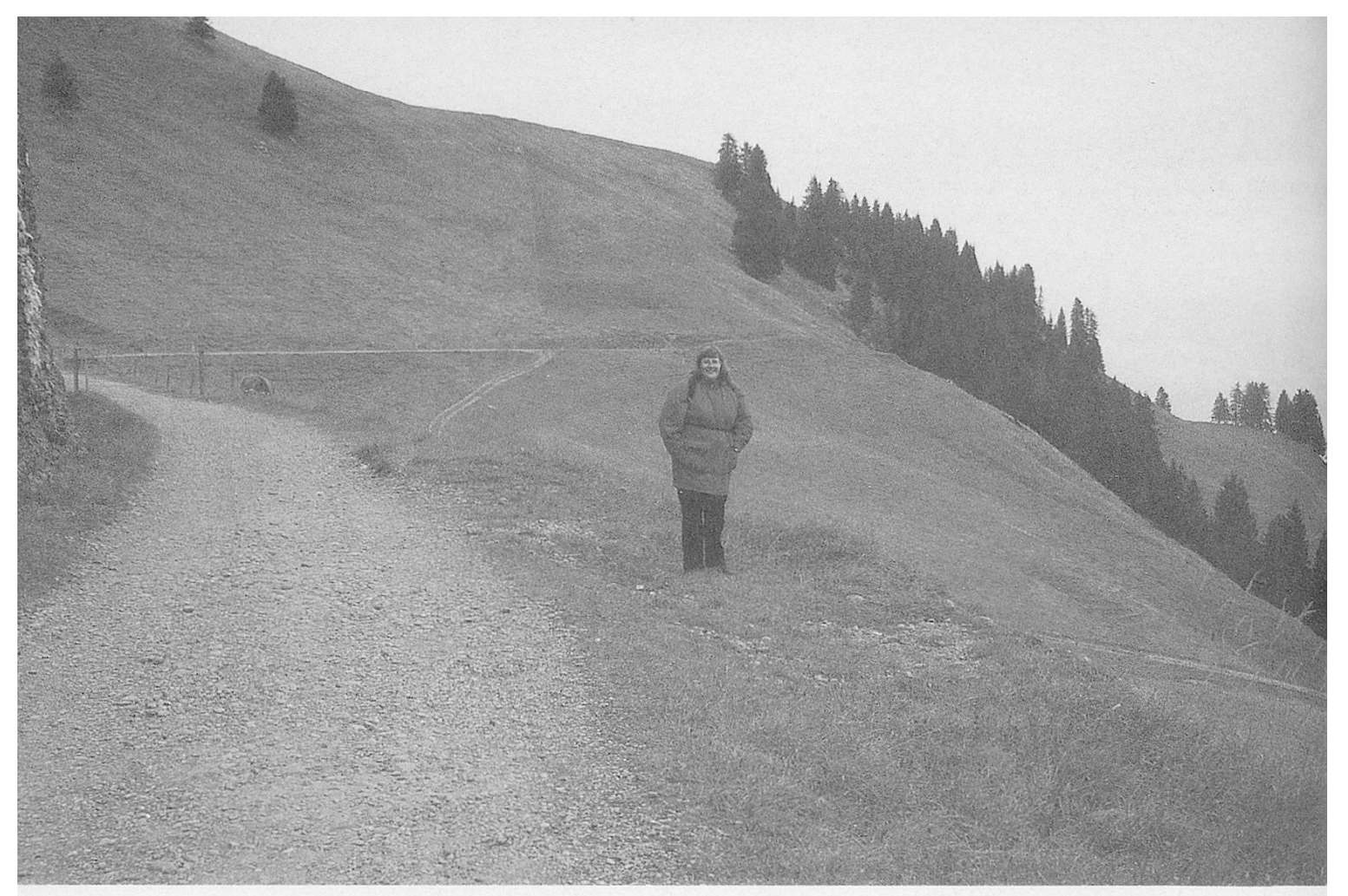
Above: Myself, to one side of the path which can been seen curving around the side of the hill.

member of the Society, but I read Swiss Express.