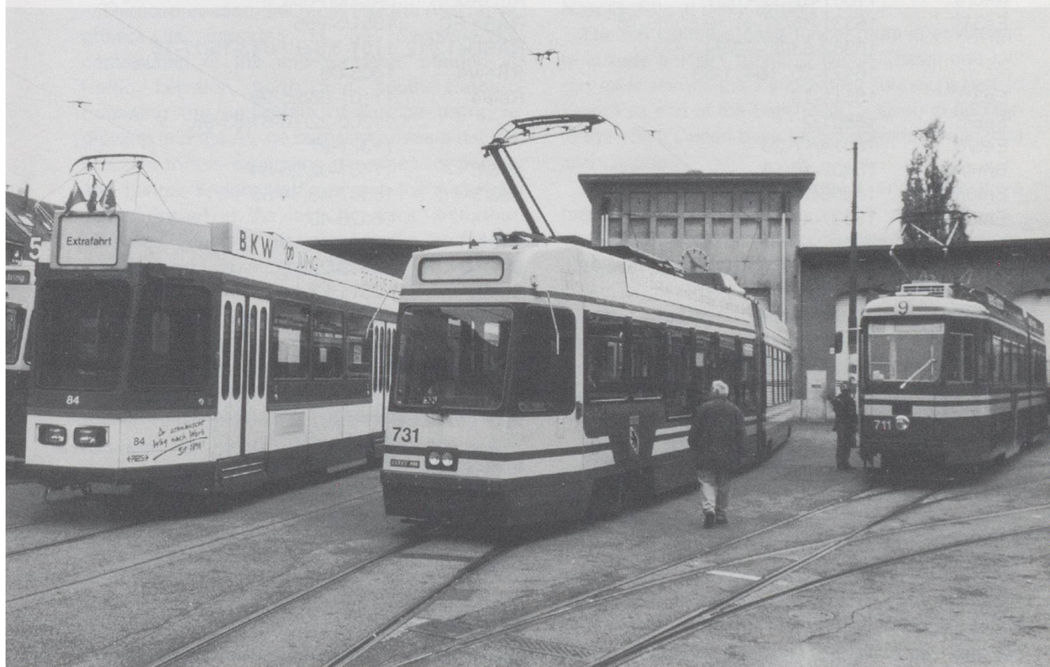
Above and Below: Two views at Bern Burgernziel depot. The old unit in a works livery, and a selection of early to late models. Referred to in the article.