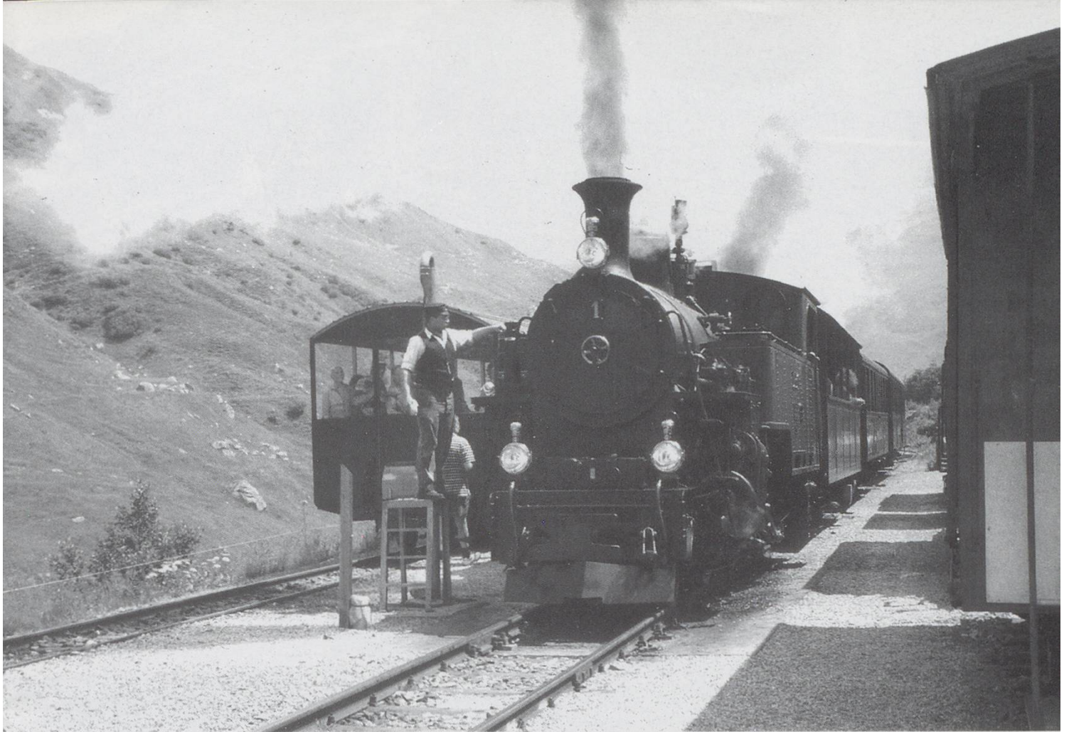
Above: No 1 "Furkahorn" taking water at Tiefenbach with 13.05 ex Realp. Train on left, hauled by NO. 2 Gletschorn, was ex 13.05 Furka. (24/7/98)