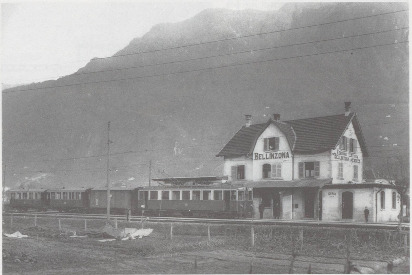
Bellinzona Mesocca Bahn. Railcar BCe4/4 arrives in Bellinzona.