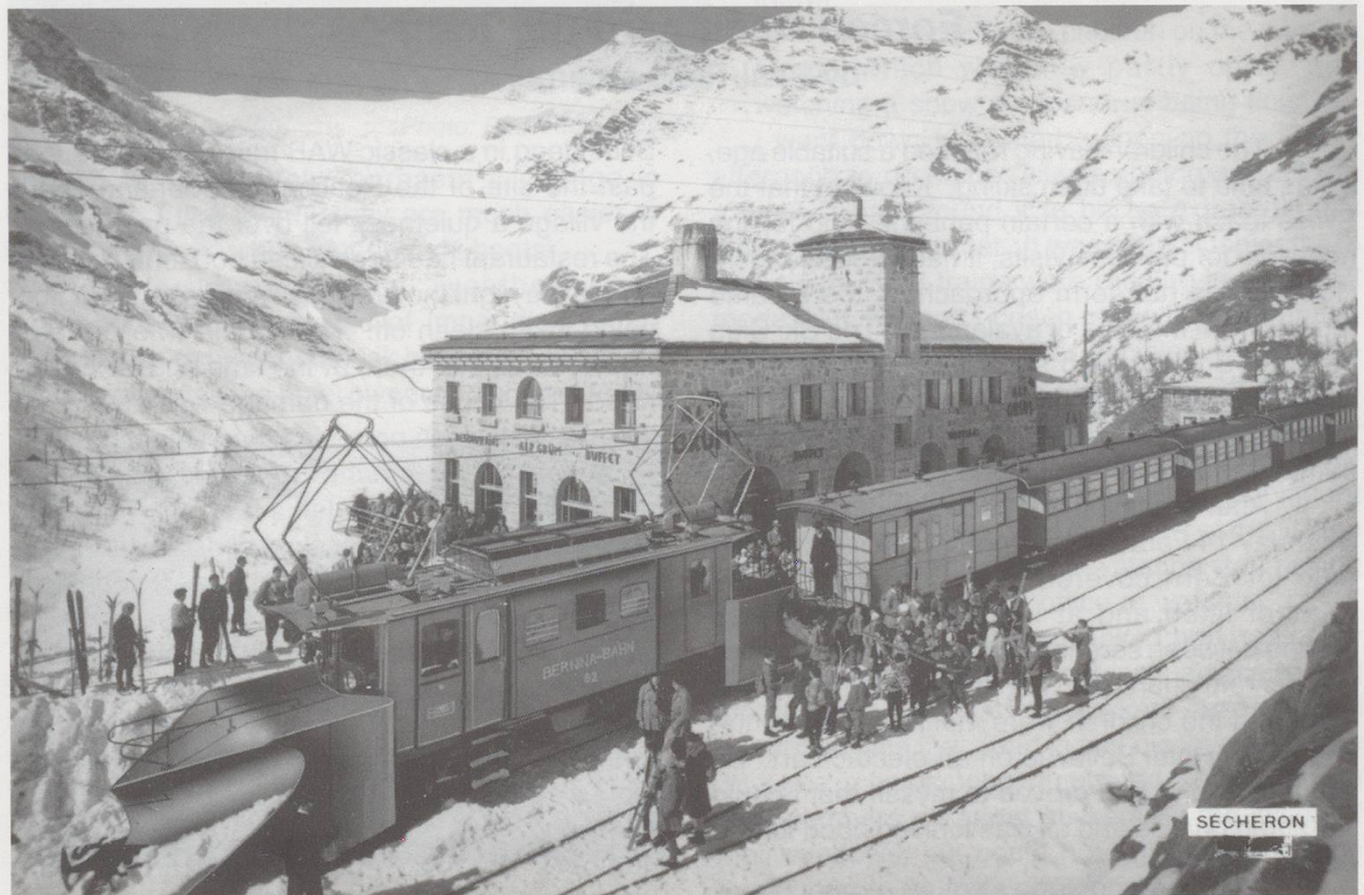
Alp Grüm: Bernina Bahn loco Ge4/4 No.82