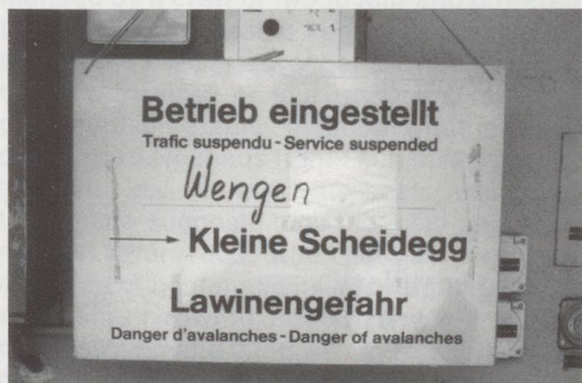
Lauterbrunnen station sign, Feb 1999.

Unfortunately, the weather then deteriorated with rumours of impending resort closure due to avalanche risk becoming reality on the Thursday, as the hotel owner told his saddened