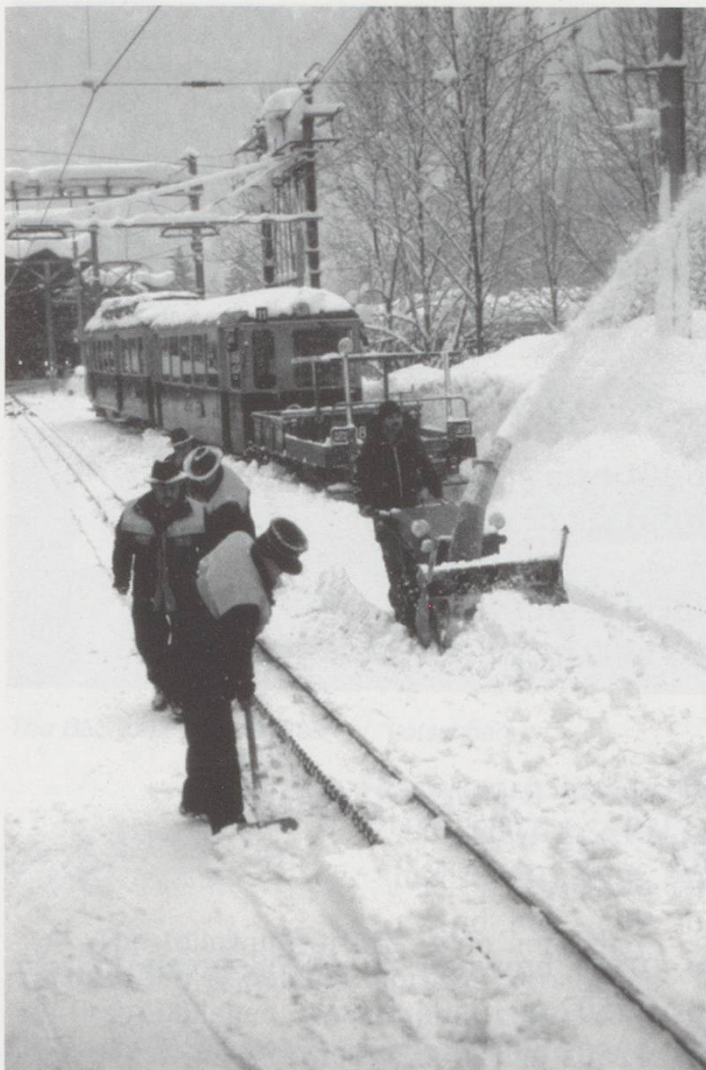
Lauterbrunnen. Feb 99.