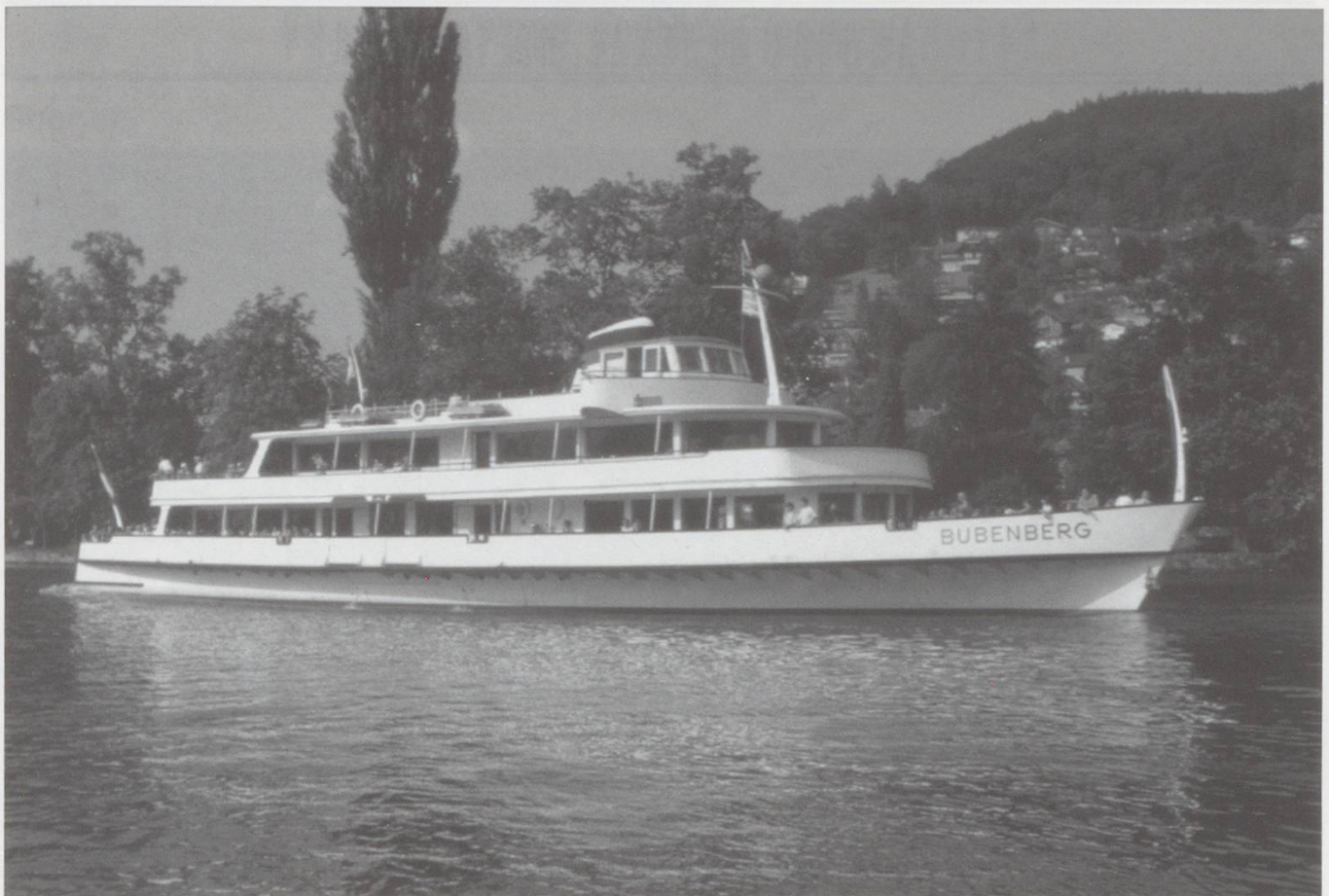
Interlaken West: BLS MS Bubenbergr going astern in the channel.