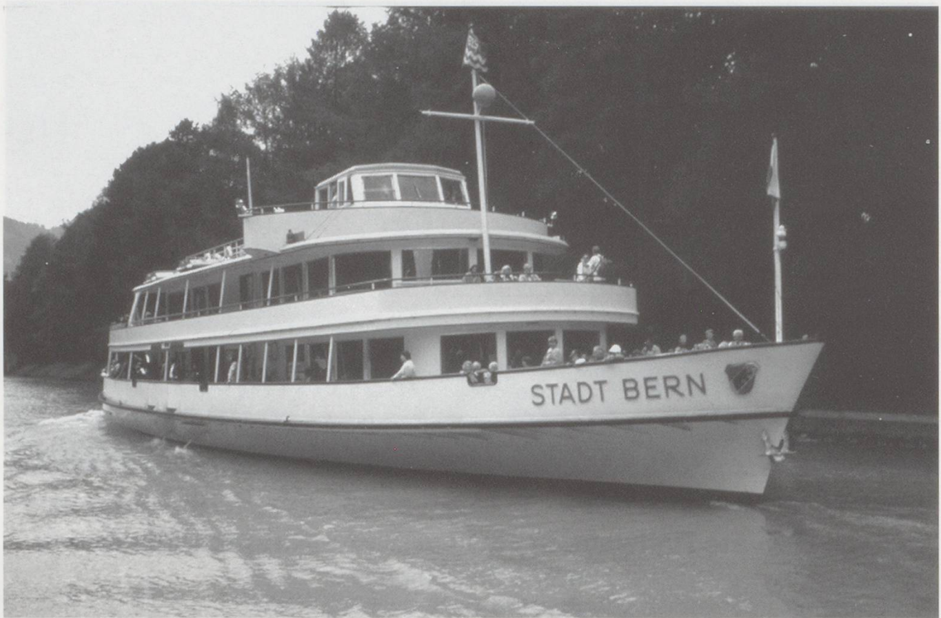
Interlaken West: BLS MS Stadt Bern in the channel.