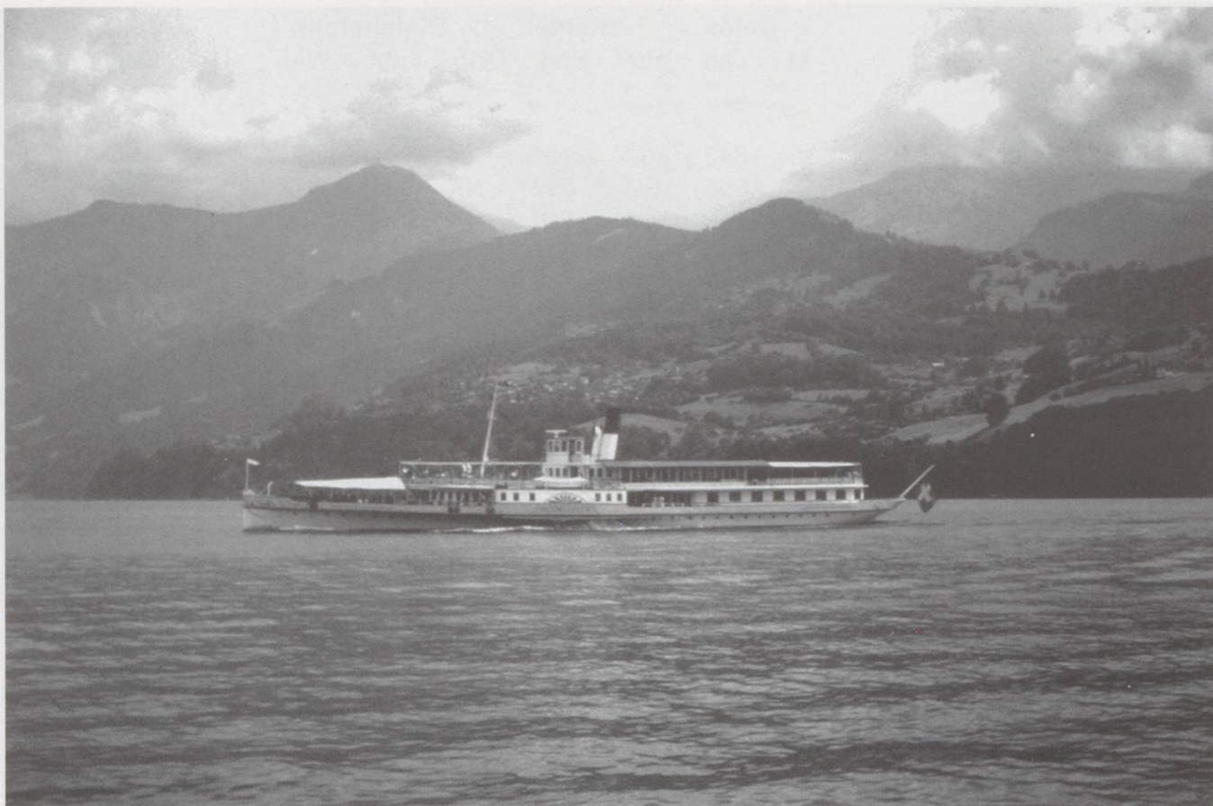
BLS DS Blumlisalp departing from Faulensee on Lake Thun.