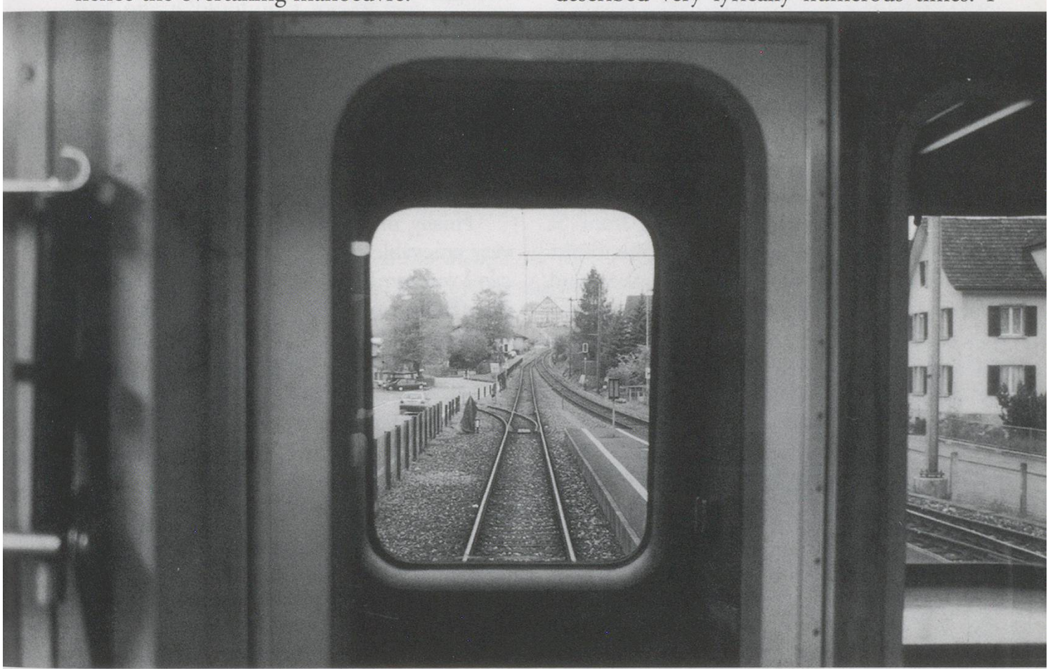
A view through the Drivers cab on Südostbahn Bt 922 as it prepares to leave Samstagern for Biberbrugg at 1241 on Monday May 4th 1998. Look at the gradient!

I suppose that I must mention the Gotthard route from Erstfeld to the tunnel mouth at Göschenen, passing the famous church at Wassen on three levels - this is very spectacular, but has already been described very lyrically numerous times. I