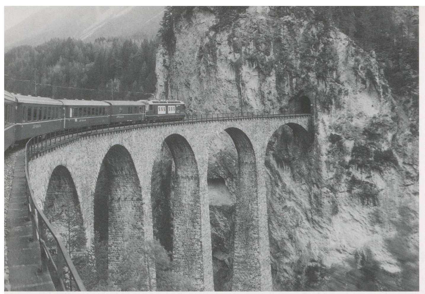
Nothing prepares you for this incredible view, so no excuses needed to see it again! 641 heads the 1652 Chur-St Moritz on Wednesday 6th May 1998.

The trip from Thusis to St Moritz, across the Landwasser Viaduct, and through the Preda curves is very scenic. As this forms part of the Glacier Express route, the trains are often quite busy. For a different view of the famous curves, do the railway walk from Preda to Bergün (not the other way around - this way is mostly downhill!).