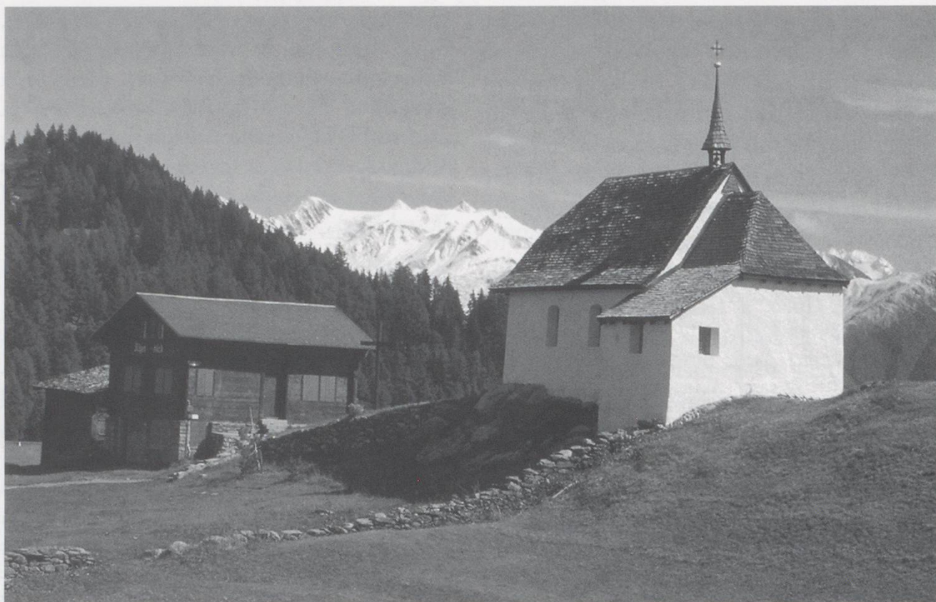
The picturesque Chapel at Bettmeralp