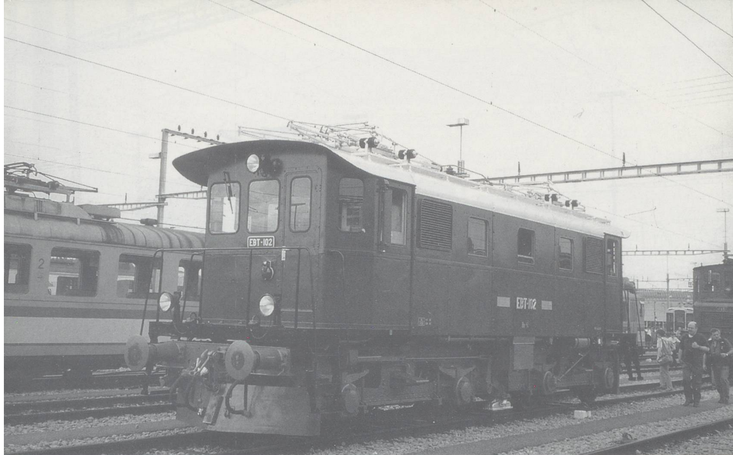
Above: EBT Be 4/4 at the exhibition.