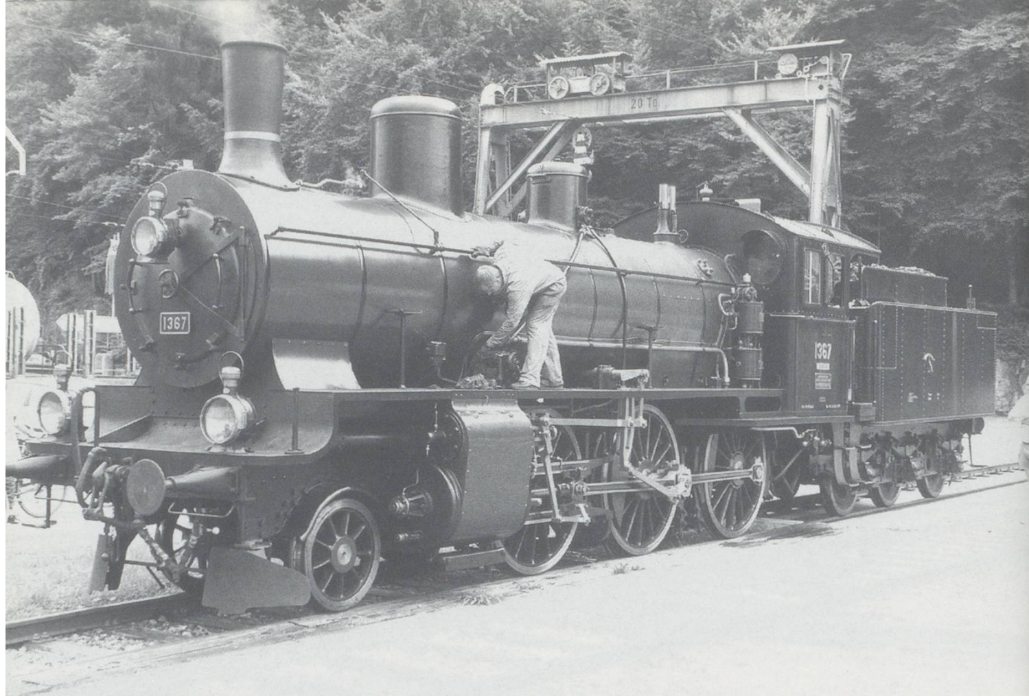
Above: Ce3/4 1367 seen here at Interlaken West on the Sunday morning getting a polish from a caring driver.

other cars pass but he was determined to drive at the same speed as the steam hauled train. Personally, my main railway interest lies in modern motive power and steam power doesn't usually stir my soul too much. The ride behind Zephir was something very special though. Probably like many Swiss Railways Society members I have used the Darligen to Interlaken route many times by road and rail but to pass through Interlaken West non-stop, whistle blowing, seeing some waiting passengers standing agog and others waving at the sight of the green and black 0-4-0 steam loco pulling a rake blue, red, green, yellow and purple wagons coupled to a tractor at the rear (for back up if need be) was definitely fun. As we came to the swimming pool the driver tooted the bathers; children ran across to run alongside the train, mothers waved and fathers stared in amazement. They evidently expected another Re 4/4 or Class 460 but Zephir and its train of colourful wagons was a very different sight.