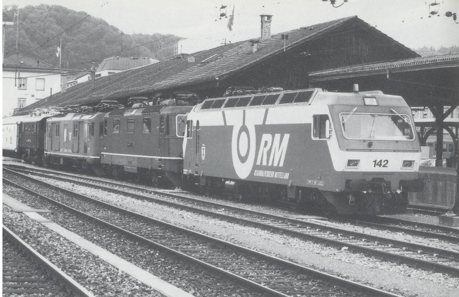
Above: Re4/4 436 142 at the 150th celebrations in Burghdorf, August 97.