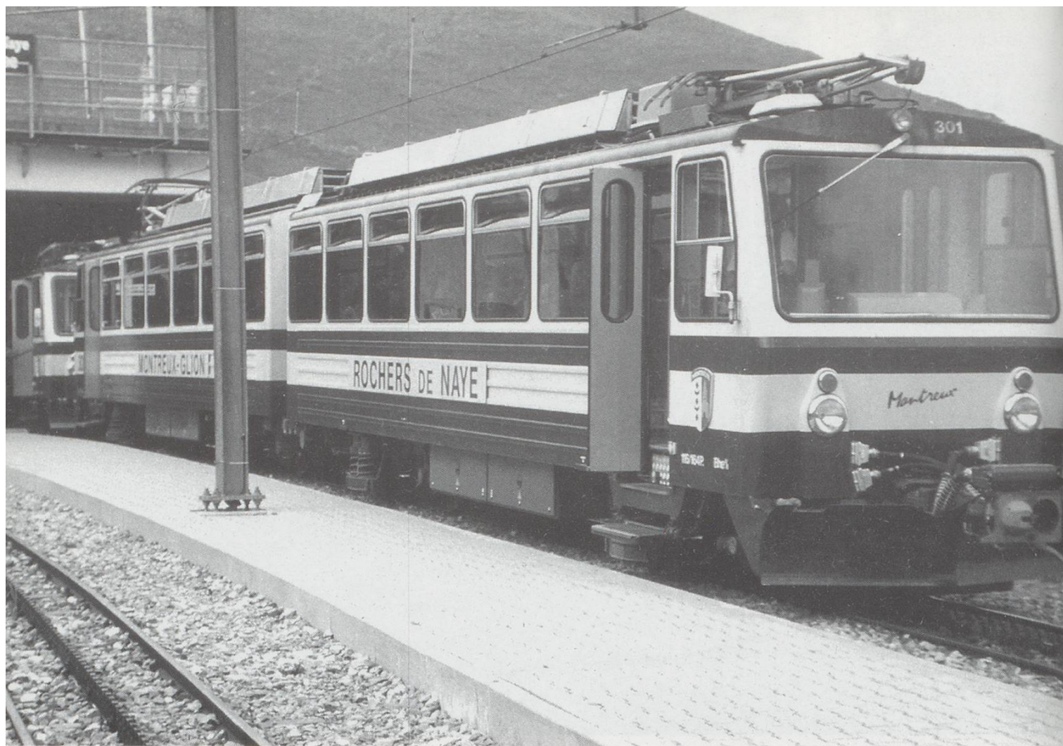
Above: Top station of the Rochers de Naye. Two of the modern units awaiting their passengers for the descent to Montreux.