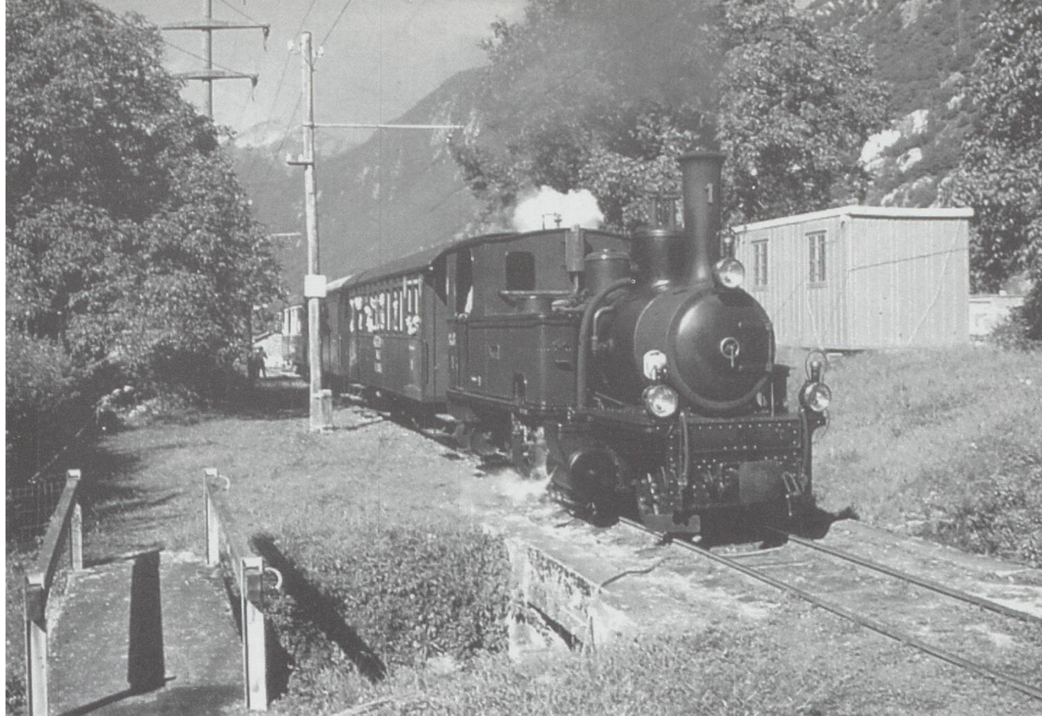
Above: Rhb No. 1 'Ratia' between Castione and Roverdo, heading up-va-lley. 31/8/97.