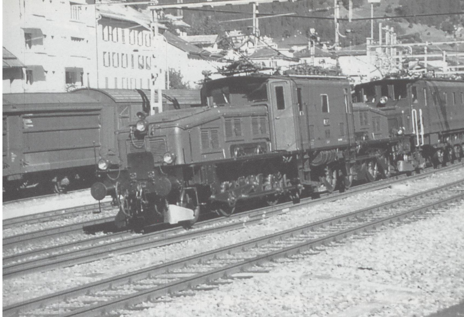
Above: Ce6/8 II 14253 headed the "1930's special" northwards through Airolo. 31/8/97.