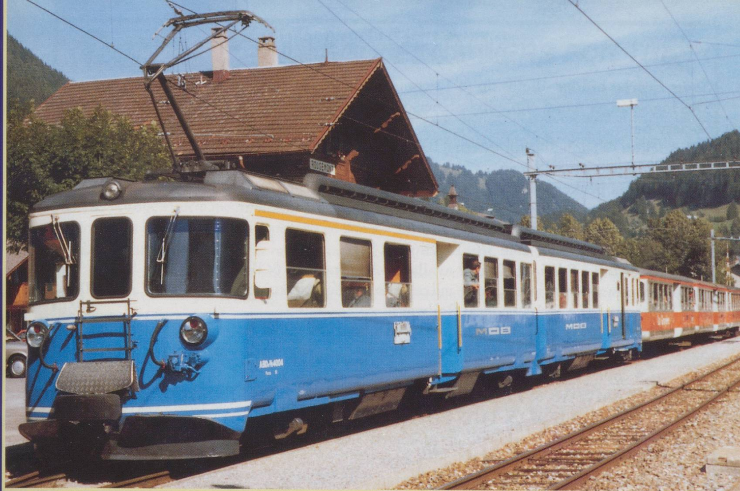
ABOVE: MOB ABDe 8/8 4004 heads some GFM stock at Rougemont. 6/9/1986. BELOW: I think it may have snowed a bit. Beat's favourite weather? Two completely unidentifiable BDe 4/4s at Rougemont.