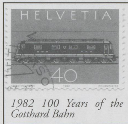
1982 100 Years of the Gotthard Bahn

In addition there have been air-mail series, stamps issued for use by soldiers on active service, and stamps given to charitable institutions and hospitals. Beyond that there are issues by United Nations and other Swiss based organisations. Special issues for use by mobile post offices in the 40s and 50s show postbuses of the era.