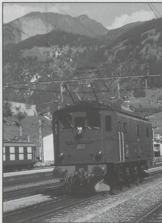
Of the several CFF classes fitted with Sécheron drive, the Ae 3/5 class was the smallest, its members sometimes being known as "Baby Sécherons". 26 of them were built between 1922 and 1925 by SLM and SAAS and spent most of their lives working in the French-speaking parts of the country. During the 1960s, 10218 10226 were modified to work car trains through the Gotthard and Simplon tunnels and one of these, 10224, was photographed at Airolo in the summer of 1967.

The final stage was to add the various detailing parts that come with the model. Although it is not necessary, I removed the body to do this and found it was a very tight fit on the chassis. The best way seems to be to ease