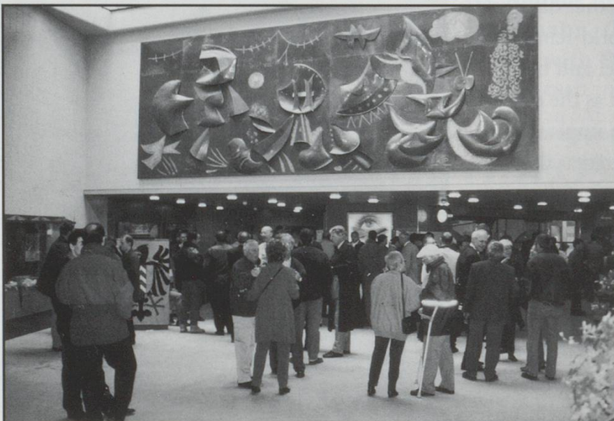
End of opening ceremony at lower station - Jardin Anglais. The haut-relief sculpture is very prominent.

The funicular is the remnant of a much more ambitious scheme part of which would have involved the extension of the tramway from Place Pury to the foot of the funicular although, unsurprisingly, no mention of this was made at the opening. The choice of Neuchâtel for the site of Expo 2002, which will be on the lake, helped the funicular project. It cost SFr 13.5 million of