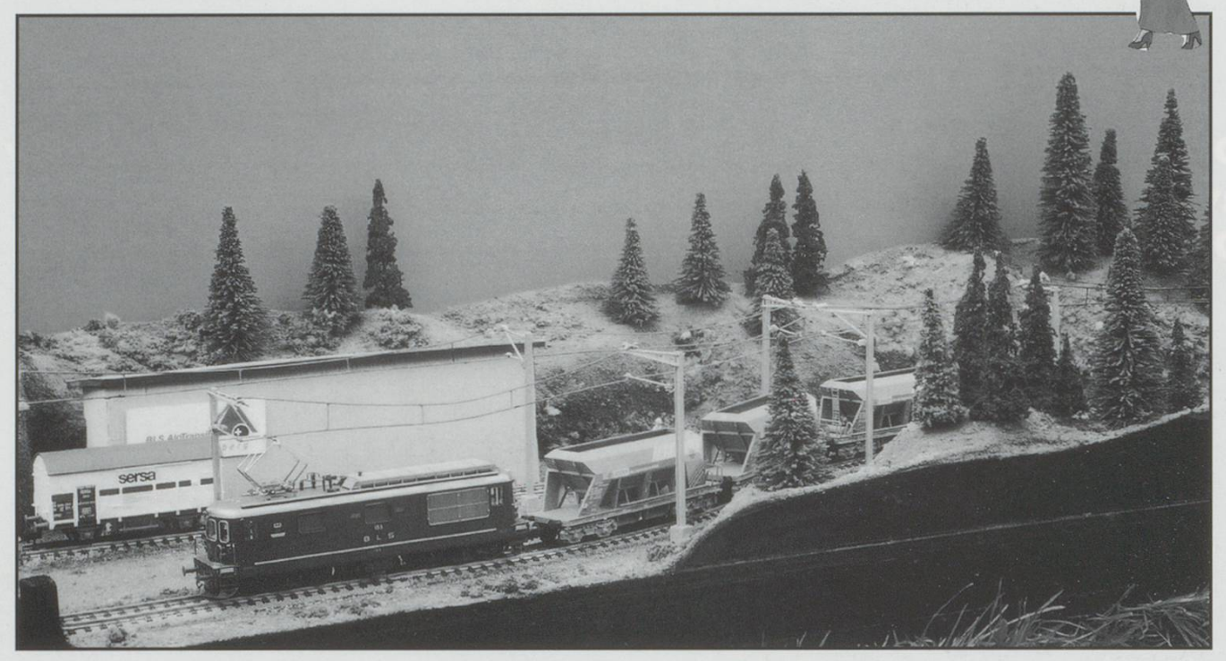
Above: A BLS Re 4/4 draws a gravel train into Alpmatten. Below right: A BLS 465 awaits its next turn at Alpmatten. turn at Alpmatten.

This compact layout made its public debut at the 1998 Swiss Railways Society AGM at Stevenage. In comparison to the superb metre gauge Letchworth Club layout at the same event it was positively dwarfed! The layout appeared in its extended form at the 2001 AGM.