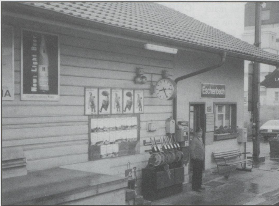
Eschenbach, 5/88. Note the old lever frame.