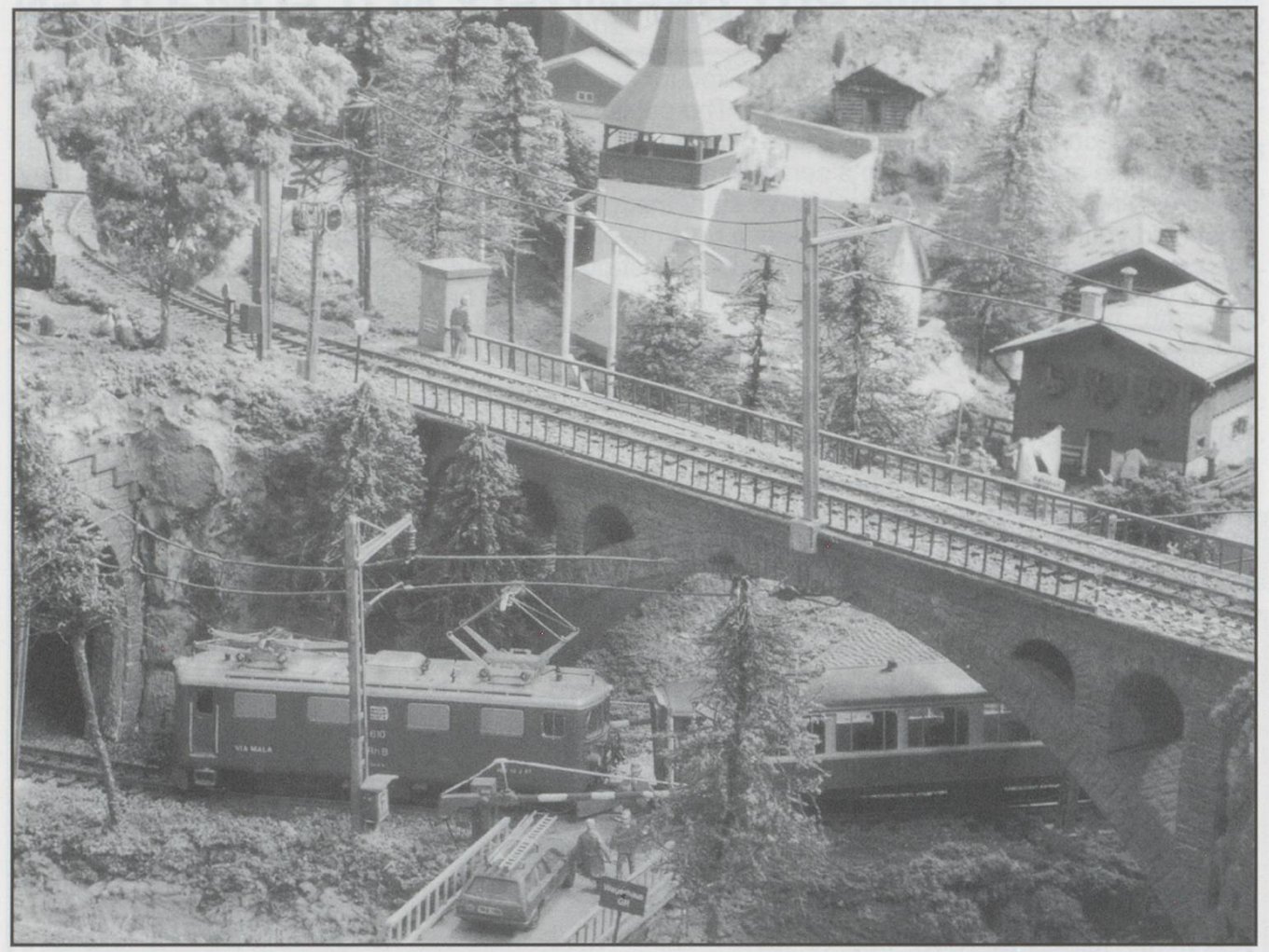
THE VERY LAST TRAIN - Driven by Mike, the oldest loco - 610 'Via Mala' hauling the oldest stock and shown at the bottom of the spiral entering the last tunnel for the last time.

Via Mala was planned in 1986 (which included a visit to the gorge), was built in 1987 and did its first exhibition at Kidlington in January 1988. little did I think that in January 1998 it would celebrate its 10th birthday at the same venue. The figures that follow include its final exhibition at Colchester on 27/28 October 2001.