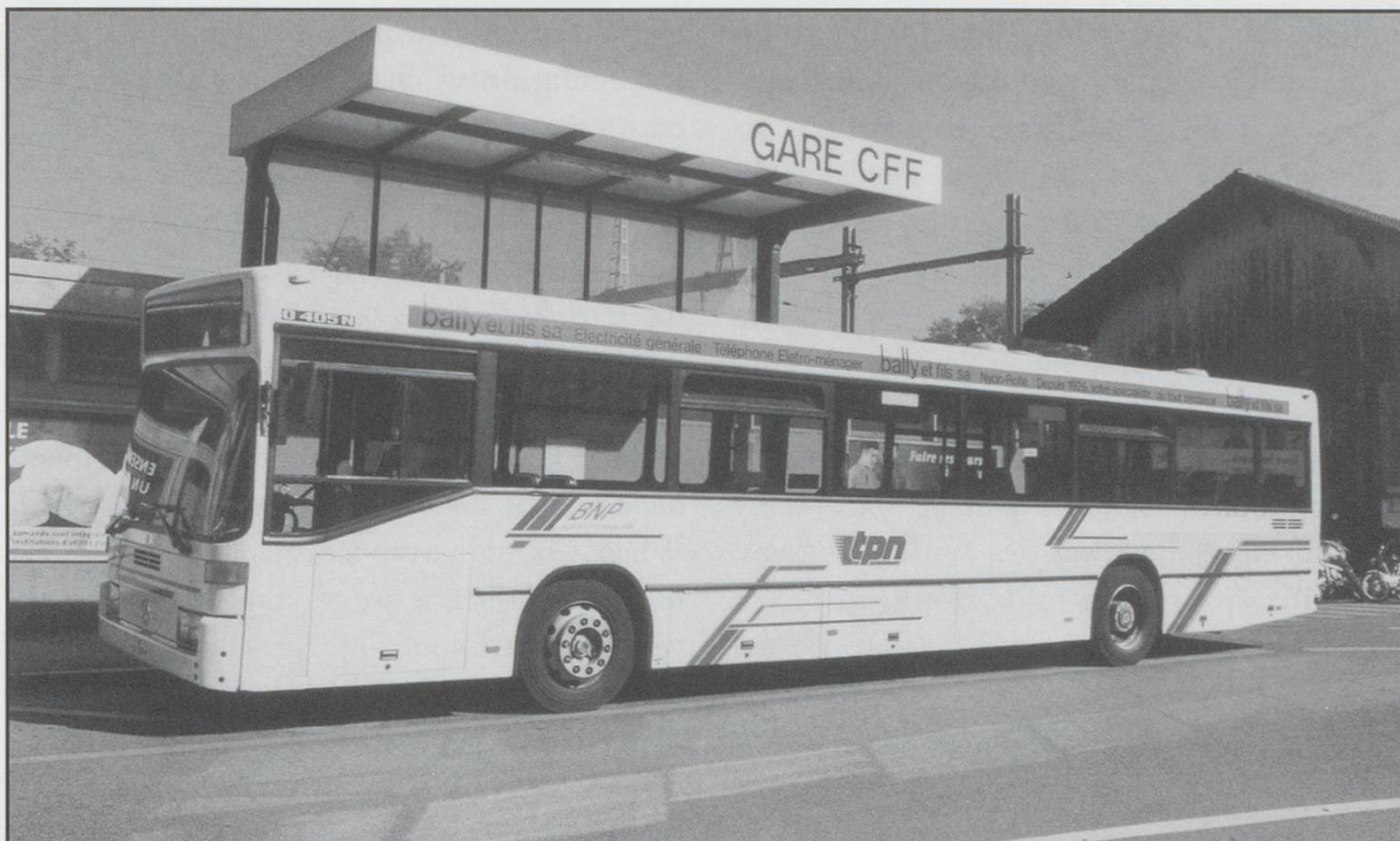
A NStCM bus sits outside Nyon station. 0945, 29/05/01.

chaos to road traffic, and happens twice an hour. Plans are being finalised for a new approach on the North of the SBB station, with an underground terminus. Although this will probably be more efficient, it will lack the charm of the present arrangement.