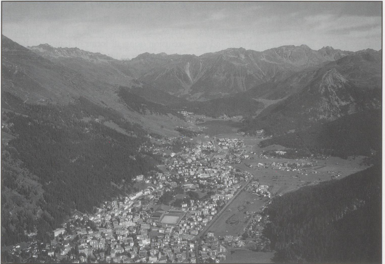
Bird's-eye view towards the north. In the foreground Davos-Platz with its sports and high altitude centre and (centre) Davos-Dorf with the lake. In the distance, the Wolfgang Pass and the alpine landscape around Klosters.