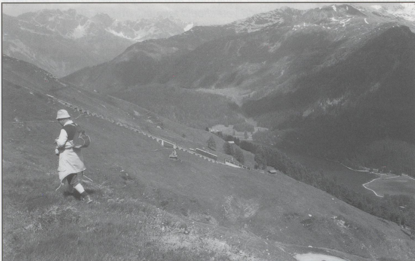
The Parsennbahn can be seen in the background from the path enroute to the Strelapass. Photograph taken by Pete Dyson in 1989.

The other path from the Strelapass heads towards Langwies Station. The difficulty on this one lies in the initial descent over loose scree from the Pass. Other than that it's an easy stroll downhill all the way via Dörfli and takes just over 2 hrs. On return to Chur one has the