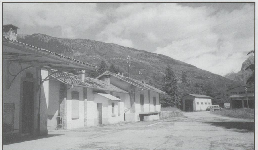
Acquarossa Station, ex-rail, now bus

There are a couple of preserved railways in the Ticino, and they are definitely worth a visit. The first one and by far the best known is what remains of the former RhB Mesocco line which runs from outside Castione-Arbedo station to Cama (which is actually in Graubünden), gives a discount off its fares to holders of the Swiss Pass, and allows children to travel free. The volunteer staff there speak English, and it is a charming ride through fields and vineyards. The train consisted of an ex-Appenzeller Bahn railcar and coach. My favourite part of the trip was when a man with a flag was set down beside an ungated level crossing, and left there to warn of further trains during the afternoon! There is a small shop at Cama, selling postcards and videos about the railway. How could anyone resist purchasing one?