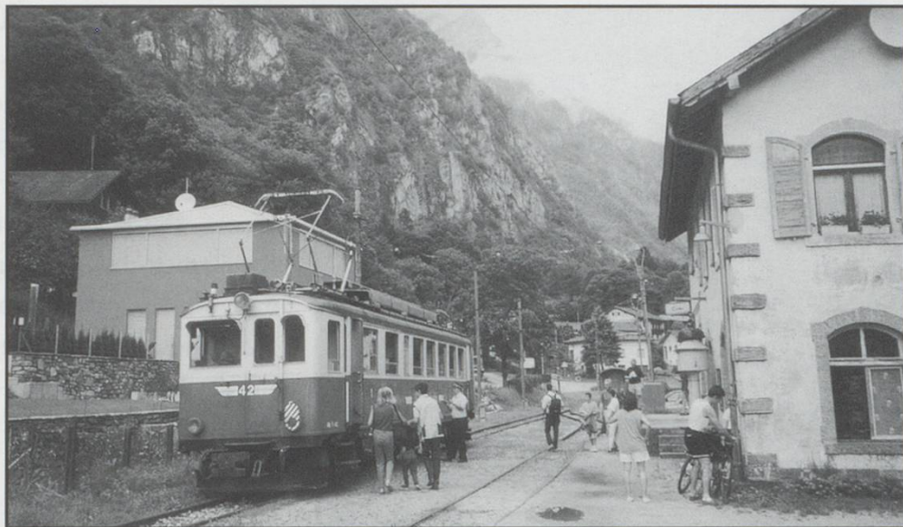
Cama - terminus of Misox line from Castione

The second preserved railway worth a mention is the San Gottardo from Mendrisio to Valmorea. When we arrived at Mendrisio Station to catch this train things did not look very promising. However, the man in the SBB ticket office spoke English, and explained to us, as he sold us tickets for the preserved line, that we had to go under the subway as far as possible, and emerge in the car park. The platform was non-existent, but that's not unusual in Switzerland. We travelled in the coaches of the San Gottardo, pulled by a steam locomotive, through Stabio, and onto the Swiss/Italian border, where we paused for border guards to open the gates, and customs staff (both Swiss and Italian) to board. It was certainly easy to distinguish which was which nationality - the Italians had lots of braid and epaulettes, and swaggered! We were amazed that they felt it necessary to travel on the train at all. The trip to Valmorea goes through attractive woodland, and emerges at the station, where there is a small shop and somewhere to buy coffee. Highly recommended! On certain dates, a vintage electric loco-