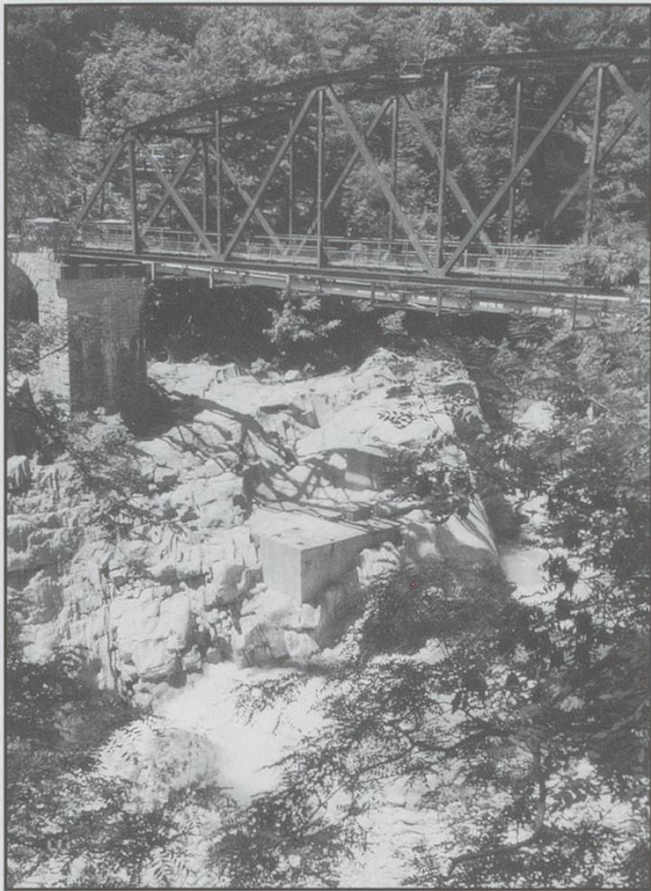
Old railway bridge near Ponte Brolla on Bignasco-Locarno line