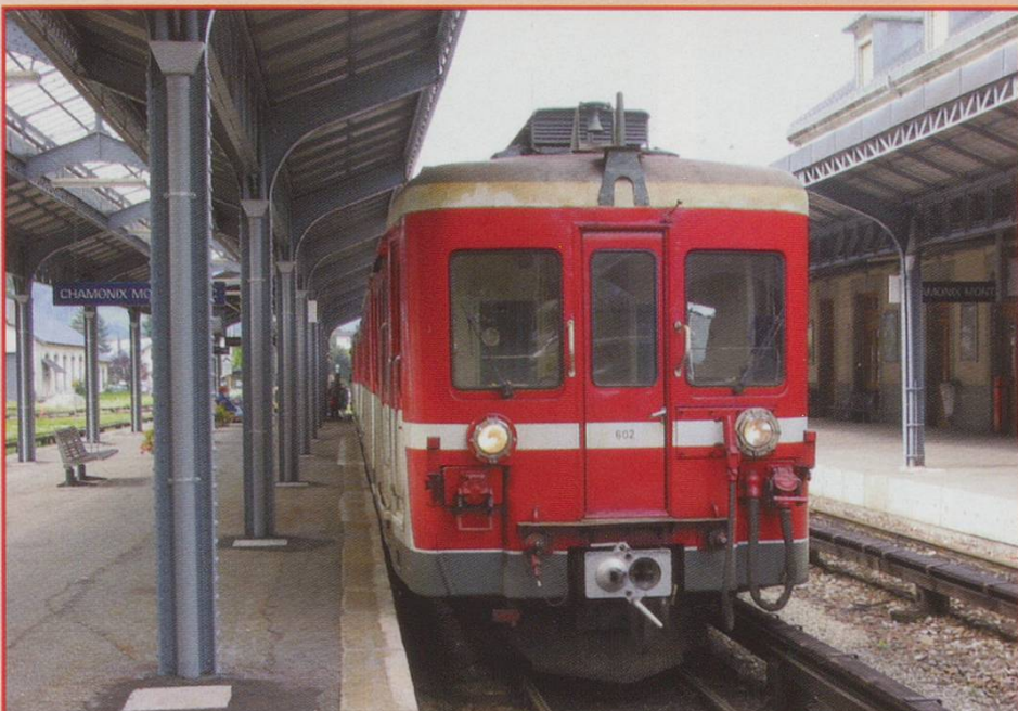
ABOVE: MC No 3 at Chamonix 4th September 2002

LEFT:MC No 602 at Chamonix 4th September 2002