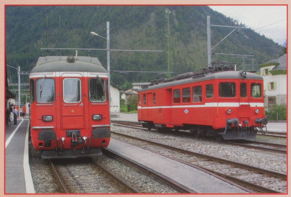
LEFT: ABDe4/4 No 5 & No 6 Orsières at Orsières 4th September 2002.