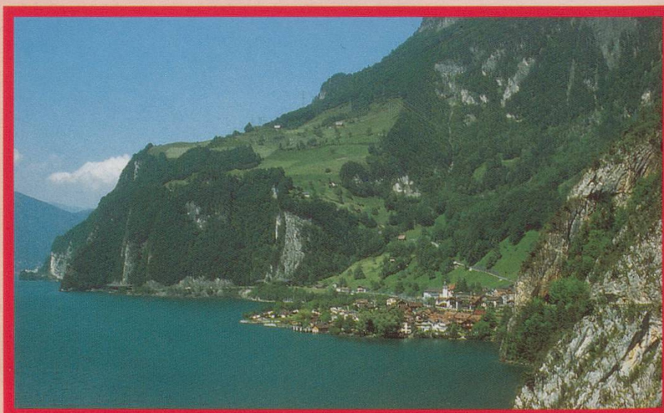
Sisikon 30/05/02 - A view of Sisikon from Grawegg on the Axenstrasse. the keen sighted may be able to spot an Re6/6 passing on a S/B train of car transporters though the N/B train of empty flats passing at the same time is a different proposition.

However, I did not linger for more shots in these difficult lighting conditions and headed