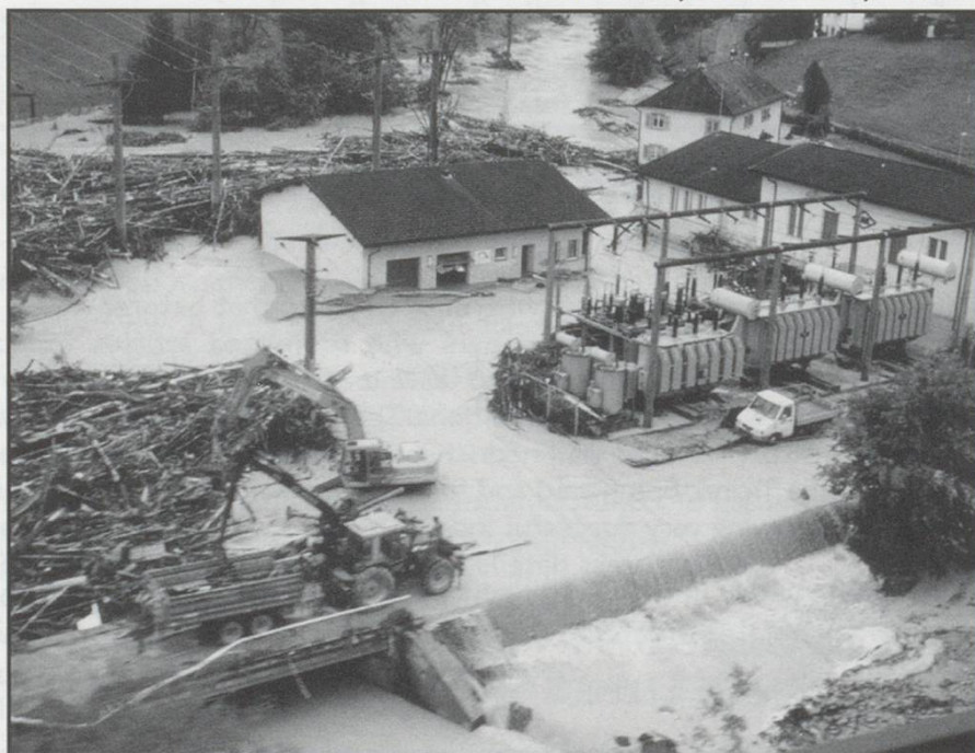
The electric power depot near Goldach, the morning after the flash flood. Taken from the train to St Gallen, 1/9/02

With effect from 14th October 2002, the former MThB/Lokoop locomotives Ae 477 900 - 913, 915 - 917, 930 have been renumbered Ae 411 001 - 018 in the SBB series, whilst Re 486 651 - 656 have become Re 481 001 - 006. Ae 476 012 (formerly SOB Ae 476 468) becomes Ae 012 042. All are allocated to SBB Cargo. It is believed that the Red Arrow