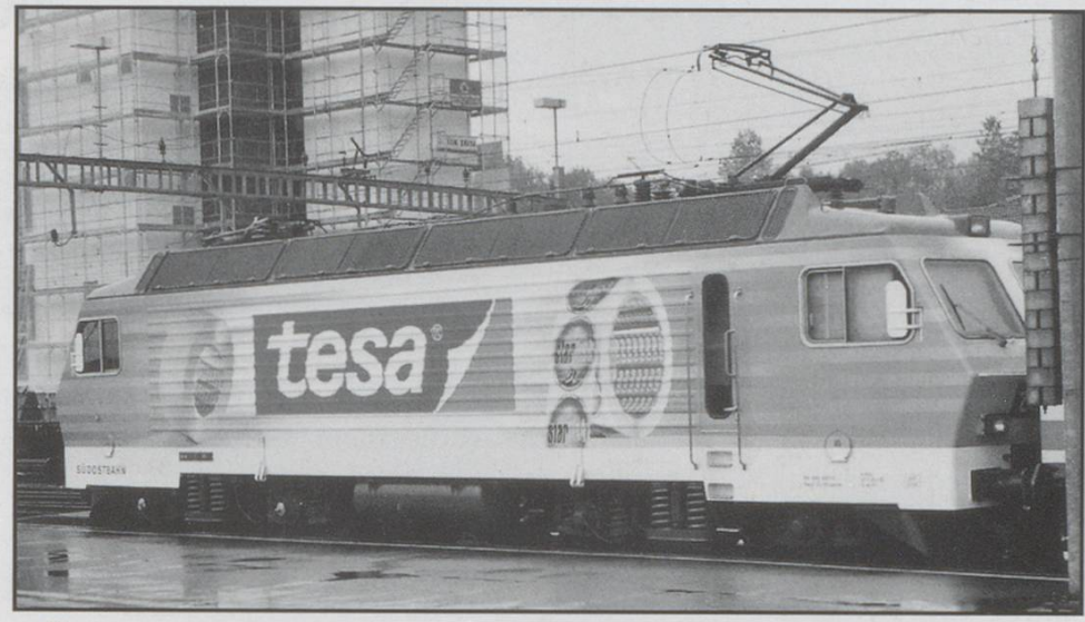
SÜDOSTBAHN LOCO IN NEW "TESA" LIVERY

Something for the editor as a Südostbahn fan: Re 446 (Ex SBB Re 4/4 <sup>IV</sup> 447-5) in the livery of Tesa, a maker of adhesive bandages, in the pouring rain, yet again, at Arth Goldau, 30th September.