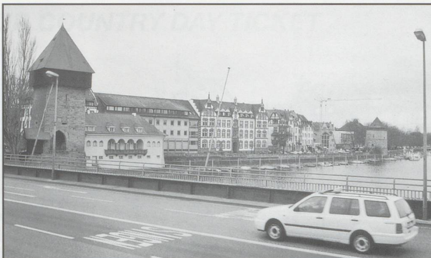
From Friedrichshafen, I took a German train along the northern shores of the Rhine, to Radolfzell. From there, a MittelThurgau Bahn electric railcar, running a border crossing service from Engen, Germany to Weinfelden in Switzerland. Here we cross the Rhine at the pretty town of Konstanz. Not a border crossing: both shores are inside Germany.

this site, about a frog (the logo and mascot of the new ticket) catching insects with his tongue, earning points. Aimed at kids, who can win free day cards and then will pester their parents to ride. Great fun, although a stork caught my frog, before I could clock up a reasonable score . . .