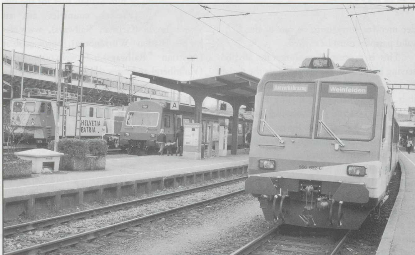
This is Konstanz railway station in Germany, but apart from the barely visible class 365 German diesel shunter, all the stock is Swiss! The Ae 477 (ex DR) in "Helvetia Patria" livery (an insurance company), belongs to the MittelThurgau-daughter Lokoop; the driving trailer is from an "Swiss Express" set (SEE, mark III stock, not us!), running a "RX" (Regional Express) service to Zürich airport, sometimes extended to Bern-Geneva Airport, known as "City Vogel" and finally a MThB class 566 electric railcar. Truly Euregio!