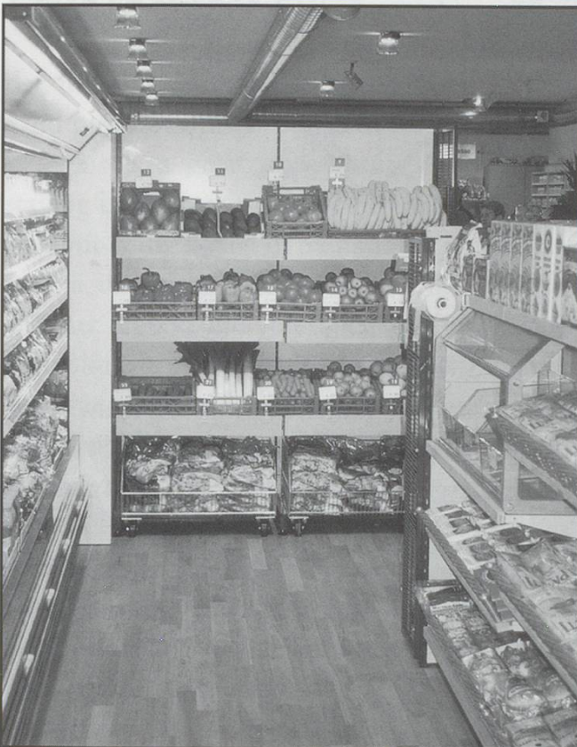
LEFT: As in other avec stores, the range is based on that of Migros, one of its partners. Prices are also the same as in the supermarkets. Fresh produce is also on sale.