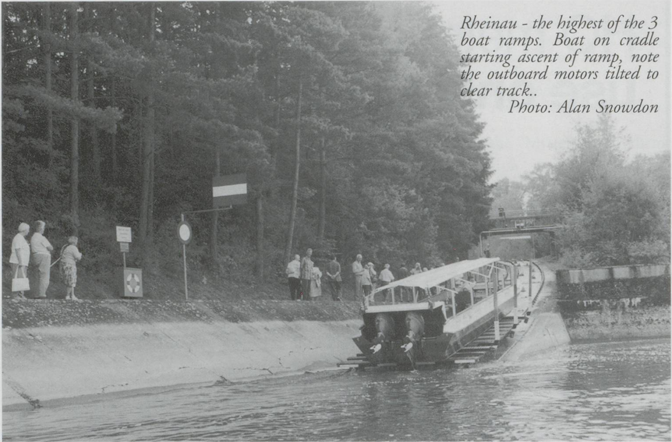
Rheinau - the highest of the 3 boat ramps. Boat on cradle starting ascent of ramp, note the outboard motors tilted to clear track..