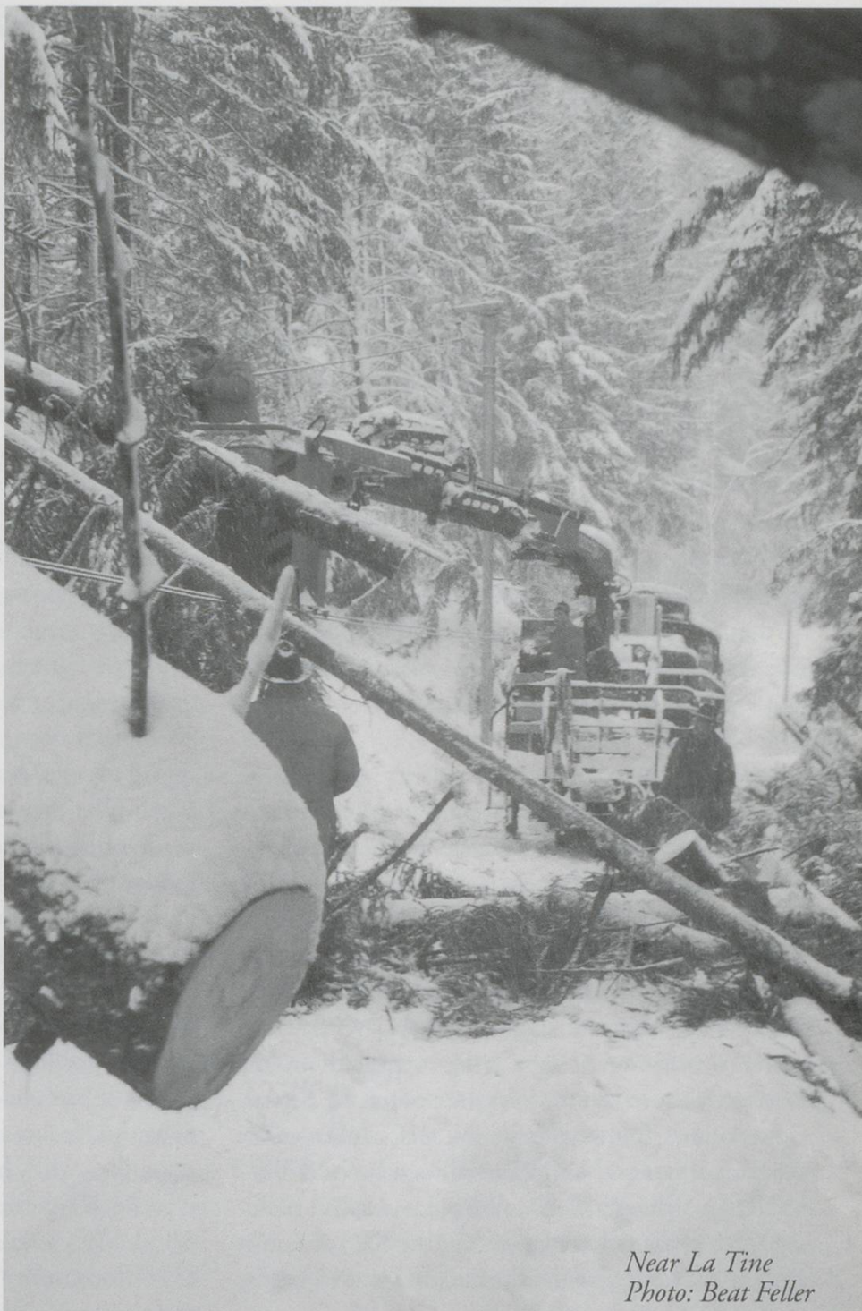
Near La Tine

Zweisimmen to Château d'Oex was reopened to trains on 14th January. First from Zweisimmen was the 1600, immediately after we had tested the line and signalling with Be 4/4 1003. Fortunately as we passed Les Borsalets level crossing, on the main road between Les Granges and Les Combes we stopped to photograph our little train which someone had decorated with a few flags. So we noticed that the level crossing barriers remained down. This was traced to an insulation failure in the controlling track circuit. Train service between Montreux and Montbovon also restarted on 14th Jan. The remainder of the MOB reopened on 19th January. Our management offered return tickets at single