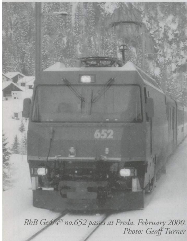
RhB Ge4/4 III no.652 passes at Preda. February 2000.