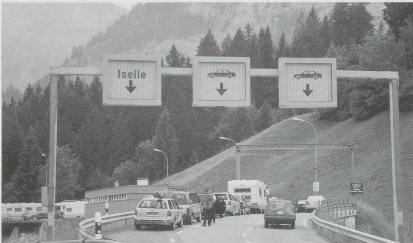
A sight not seen for many years in Kandersteg: Iselle on the destination board. Several foreign number plates and caravans.

which at that time is already sunny and warm. More to the point for this operation, they are also known for very long waiting times at the road tunnels and border crossings. This way after an hour of relaxation the alps are behind you, you have saved yourself a few hundred curves and you are only a few miles from the Italian Superstrada motorways. A few hundred cars and caravans were transported each way over these holidays. For 80 Francs per car per trip it seemed good value. The one Brit. I talked to said "for 30 quid it saves a hel-luva lot of messing about!". From the end of June until the end of September, with the exception of