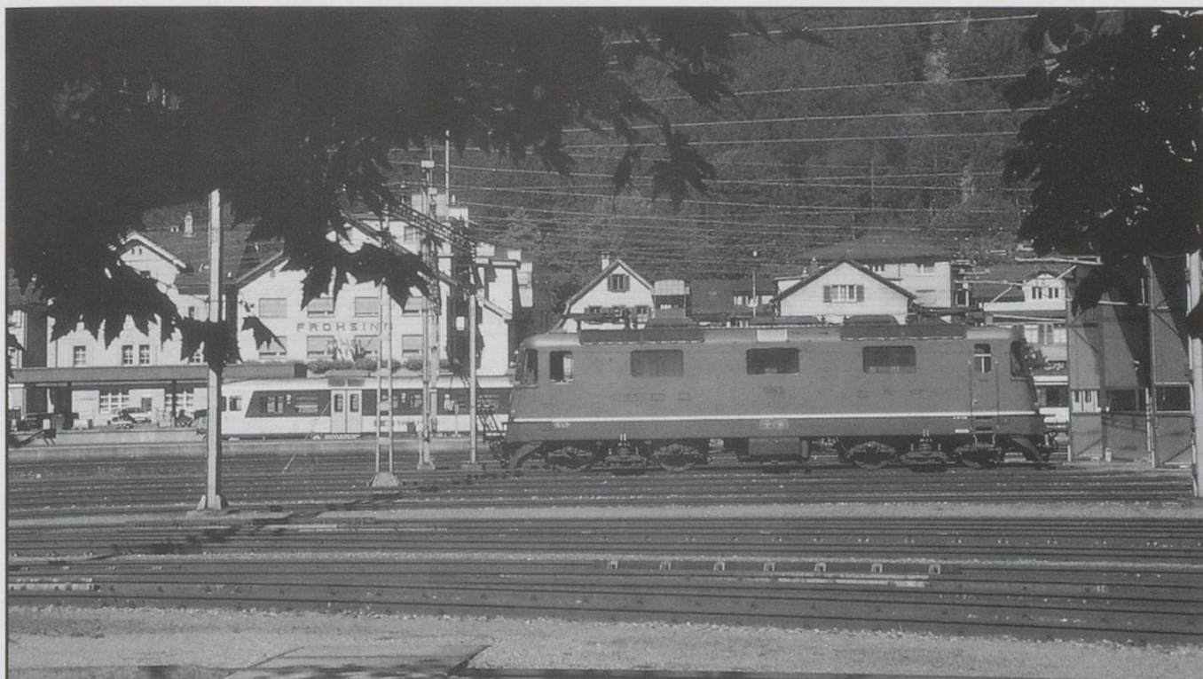
Re 4/4 III 11363 waits outside Erstfeld depot for its next turn of duty. The Hotel Frohsinn, known to many and situated less than a one minute walk from the station entrance can be seen in the background. 27/7/1998.