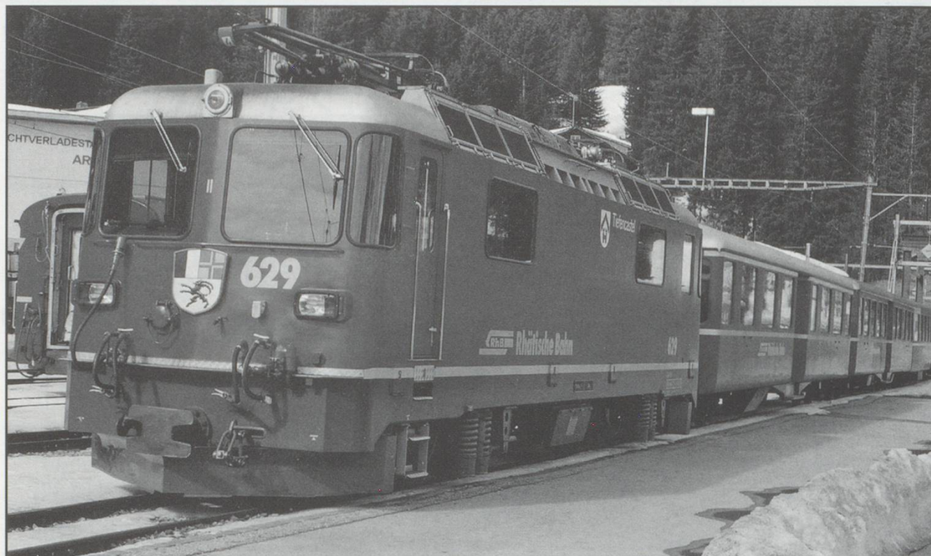
RhB Ge4/4 II at Arosa 09/03/03. Note the first class centre-entrance coach behind the locomotive.