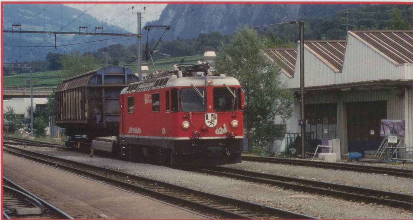
ABOVE; Ge4/ II 624 arrives at Untervaz with a standard gauge truck atop a narrow gauge transporter.

I found a dual gauge railway line alongside the road, crossing the bridge and leading into the Holcim (formerly Bündner Cement Untervaz) cement factory on the opposite side of the river. Following a brief investigation of the line as it entered the factory I returned to cross the bridge and was delighted to see the works diesel locomotive pushing a train of empty standard gauge cement tankers towards the industrial complex. I later realised that this was not just a fortunate coincidence but an event that took place on a regular basis throughout the working day. Next I tracked back along the road to determine the source of the line at Untervaz station and found it ran down behind the station area and eventually into a yard for transferring the wagons to the SBB. Of course I was primarily interested in any RhB operations on this dual gauge line and therefore decided to spend time around the station waiting to see any such action - after all there was a line of the typical RhB cement wagons waiting in the yard.