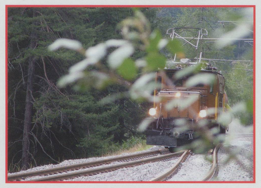
ABOVE: Truly the "Kurse of the Krok". As he mentions in the article the Kroks seem to elude him! This was taken at Filisur, September 2004.

ed deceleration accompanied by varied and multinational exclamations of surprise. The train comes to a halt. The lights go out. We are somewhat concerned. Shortly the lights come back on and from under the carriage comes the sound of machinery powering back up. Another loud Bang! The lights go out. We are now somewhat more concerned. In the gloom of the emergency lighting the wide, staring eyes of our worried fellow passengers are easily discernible.