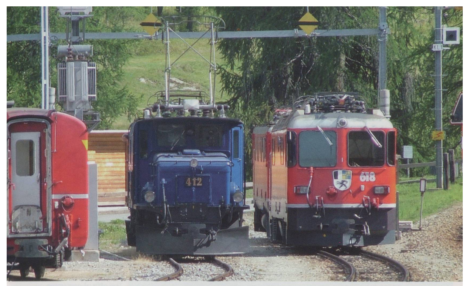
Once the camera batteries had been replaced...... Love it or Loathe it, blue Krokodil 412 at Samedan. 30/08/05

of a Frisbee and suddenly remember quite a lot of my new-found German vocabulary!