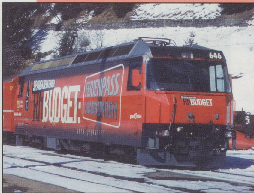
RhB Ge 4/4 646 calls at Bergun, 21.2.06

However, as we drew into Filisur, I noticed some old coaches in the Davos platform and then could see further down the platform smoke drifting skywards. I went over to the Davos platform as quickly as I could, just in time to photograph No. 107 backing off from the turntable. After a few minutes, the tour party boarded their train, leaving a few people to photograph its departure from the platform. To my surprise another member of this select group asked me to look the opposite way to see blue Ge6/6 412 appearing from the Davos direction with a water-tanker in tow. 107 duly left down the main line towards Thusis and, after it had run-round its tanker, so too did 412. A great way to end the holiday. Unfortunately, it was half an hour later when Morris & Annie arrived back in Filisur unaware of what had been going on just a few miles down the valley. Then, on the Saturday, it was back home to Britain.