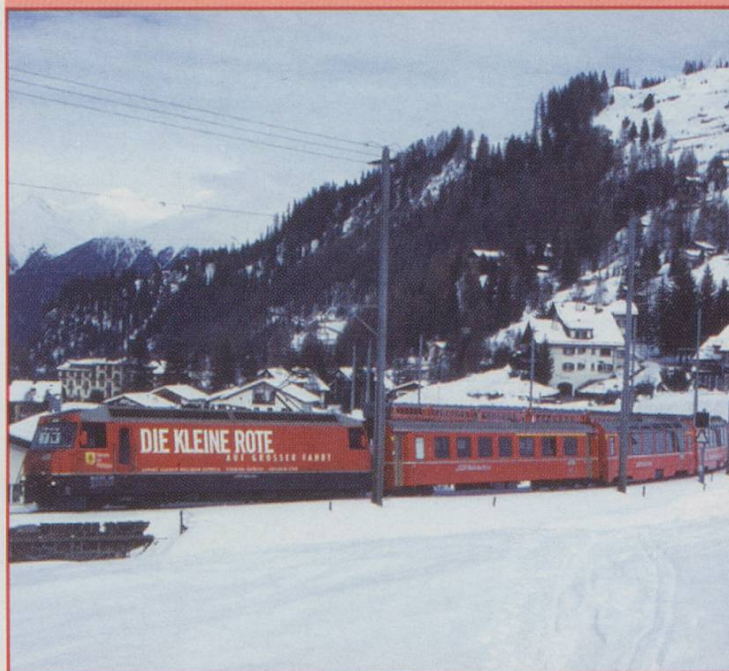
RhB Ge 4/4 650 "Seewis" begins the climb out of Bergun, 21.2.06

The next day we took the 09.00 train down to Chur and at Reichenau we had a fleeting, tantalising, glimpse of Ge6/6 'Crocodile' 414 on a freight. As we came into Chur Ae6/6 11466 was seen, equally briefly, in a siding with one bogie down in the ballast and Bm6/6 18511 in attendance with a 'Hilfswagen'. Following a tight connection we took the train up to Arosa where sunny intervals alternated with snow flurries. It was during one of the sunny spells that we did the 'tourist thing' and, looking like extras from 'Doctor Zhivago', could be seen taking a horse-drawn sleigh around the lake and village. On return to Chur I used my knee as an excuse to stay