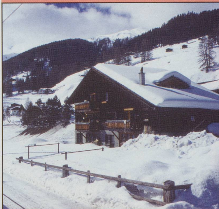
Davos Frauenkirch, 23.3.06