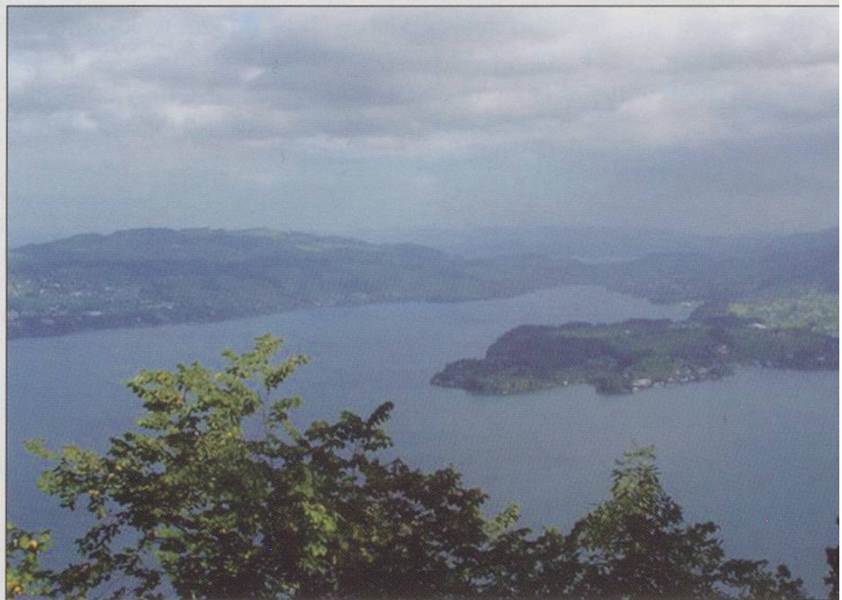
The view from the top.

In 1990 another major refurbishment was announced at a cost of 2.4 million Swiss francs. This provided a new base station plus a specially equipped panorama car, glazed on three sides. When the lift reopened in April 1992 the maximum capacity was still twelve passengers but state-of-the-art technology ensured a smooth ride whatever the load. At the same time the path from the Bürgenstock hotels was greatly improved. I imagine that it would be possible to push a wheelchair all the way to the lift, though it might be a hard job on some of the steeper slopes!