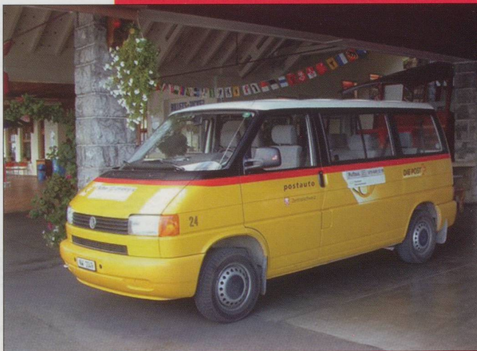
The local PostAuto at the lakeside.