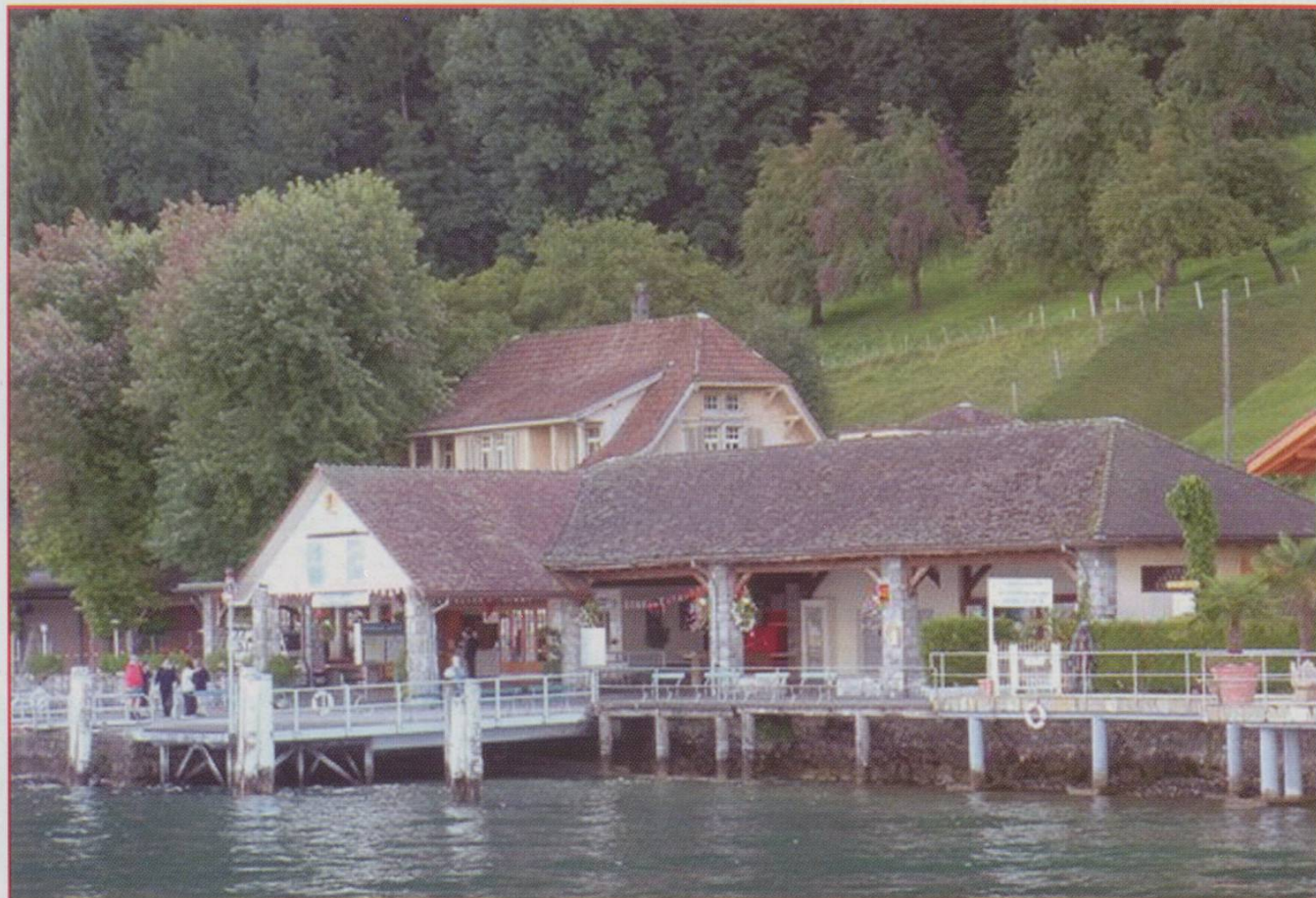
Kehrsiten-Bürgenstock lakeside station.