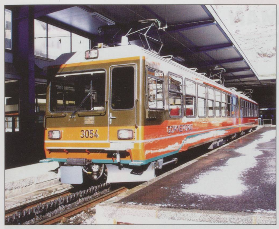
After arrival at Zermatt, the early morning sun was strong enough to have melted most the snow off the unit.

Due to the snowfall in the night, the first train is coming up with a snow blower in front. The cutting blades are clearly visible, churning up the snow below and blowing it away to the left. Note the twin pantographs: the Gornergrat Bahn was built using three phase current.