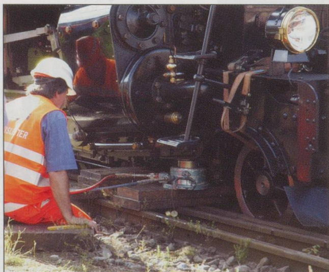
Back on track.