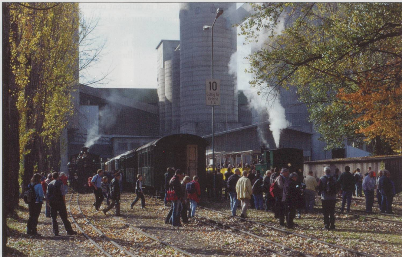
The festival area at the Holcim works.