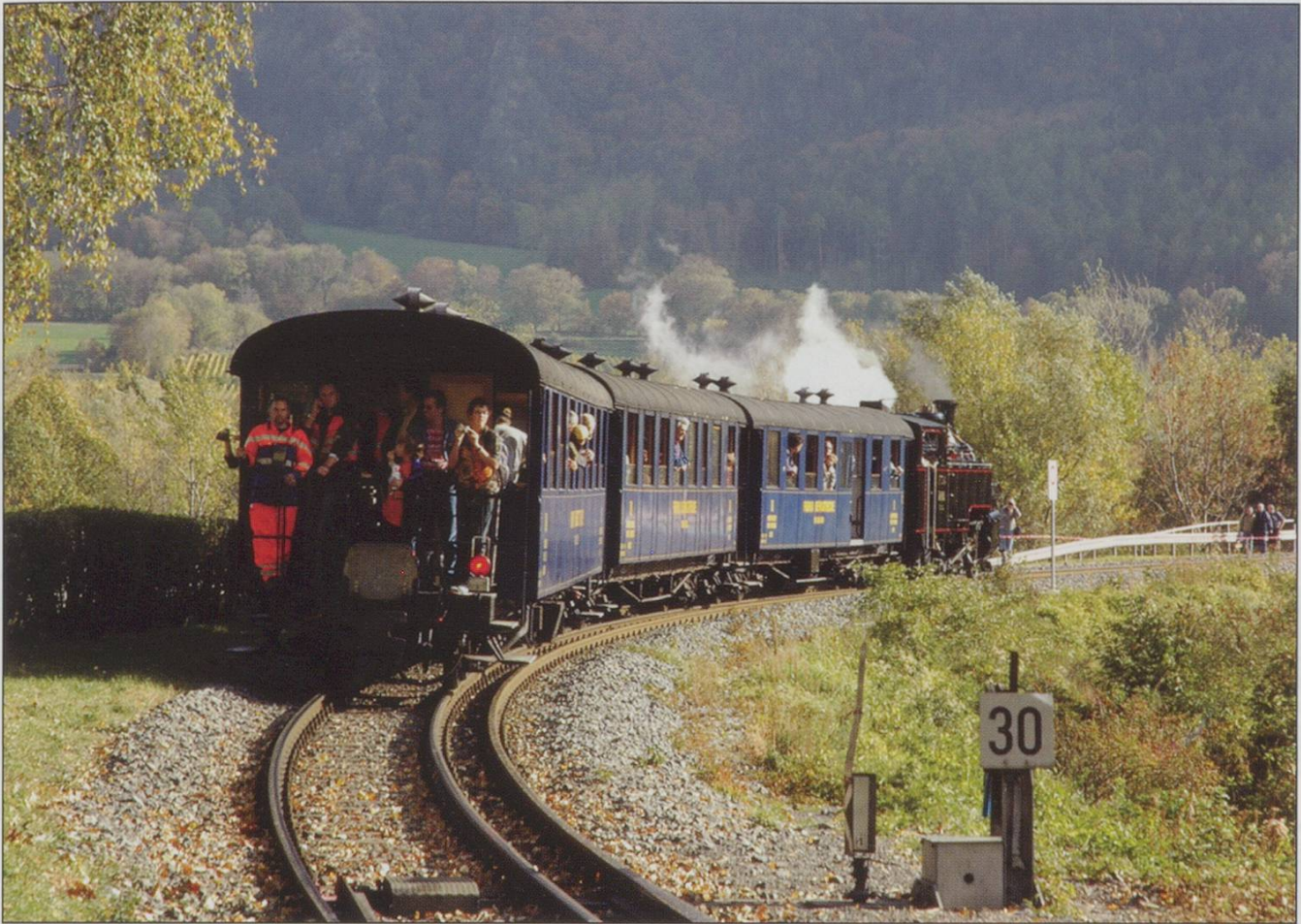
FO 4 on the shuttle train between Untervaz Station and the festival area