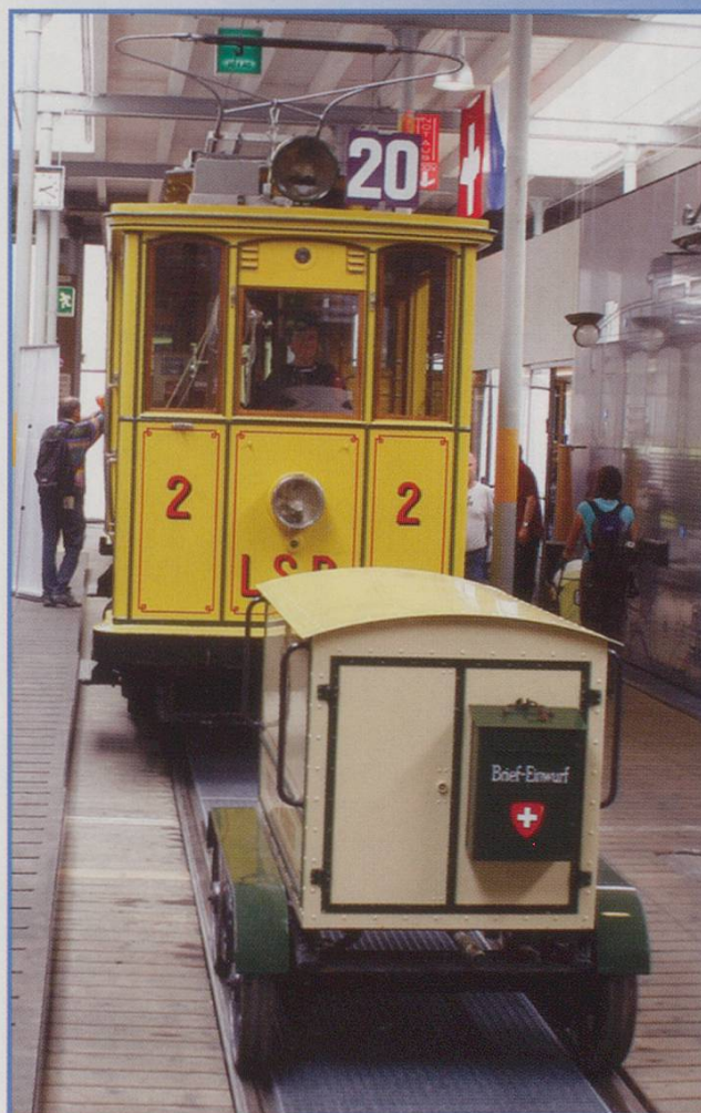
BOTTOM: LSB No.2 from 1900 stars along with its postal trailer.