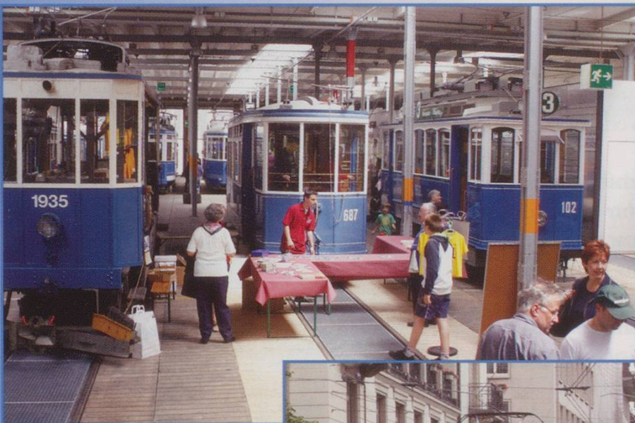
BOTTOM: TMZ's Sales Stand set-up alongside Works Car No. 1935 from 1914.