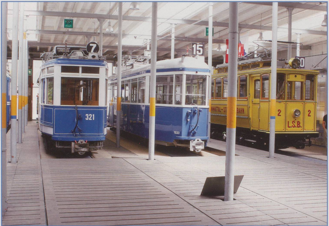
Three ages of tram.