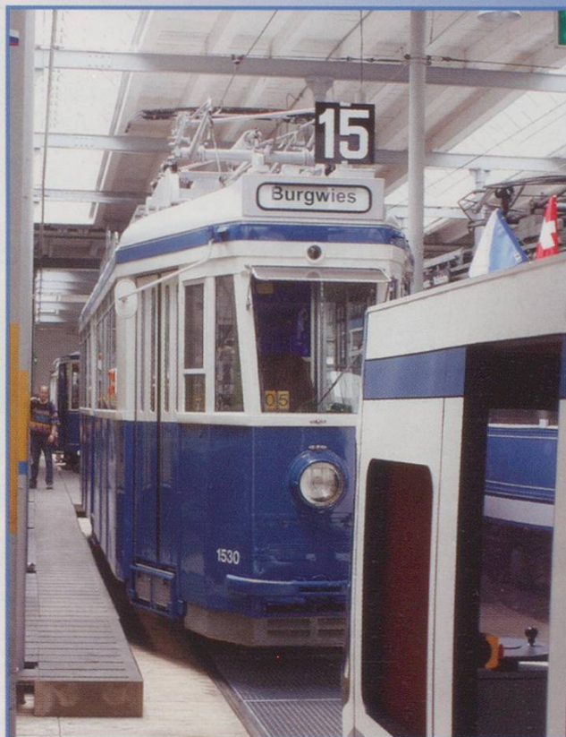
TOP: A scaled-down mock-up of a Cobra tram that children can "drive" sits with the historic stock.

As usual at this kind of event there were a number of supporting activities including local a steel band, children's activities and the inevitable snack bar featuring Bratwurst, etc. Sales stalls were provided by local preservation Societies and included an excellent second-hand bookstall. Rather than list all the vehicles present, I'll just note a couple that caught my attention: ● BVB (Bex Villars Col de Bretaye) Be2/2 8 (ex VBZ of 1907) - part of its floor has been replaced with glass so that the under-floor equipment can be seen from inside - it was also positioned over a publicly accessible inspection pit; ● Departmental 2 axle 1935 of 1914 - great to see the 'hidden' fleet represented;