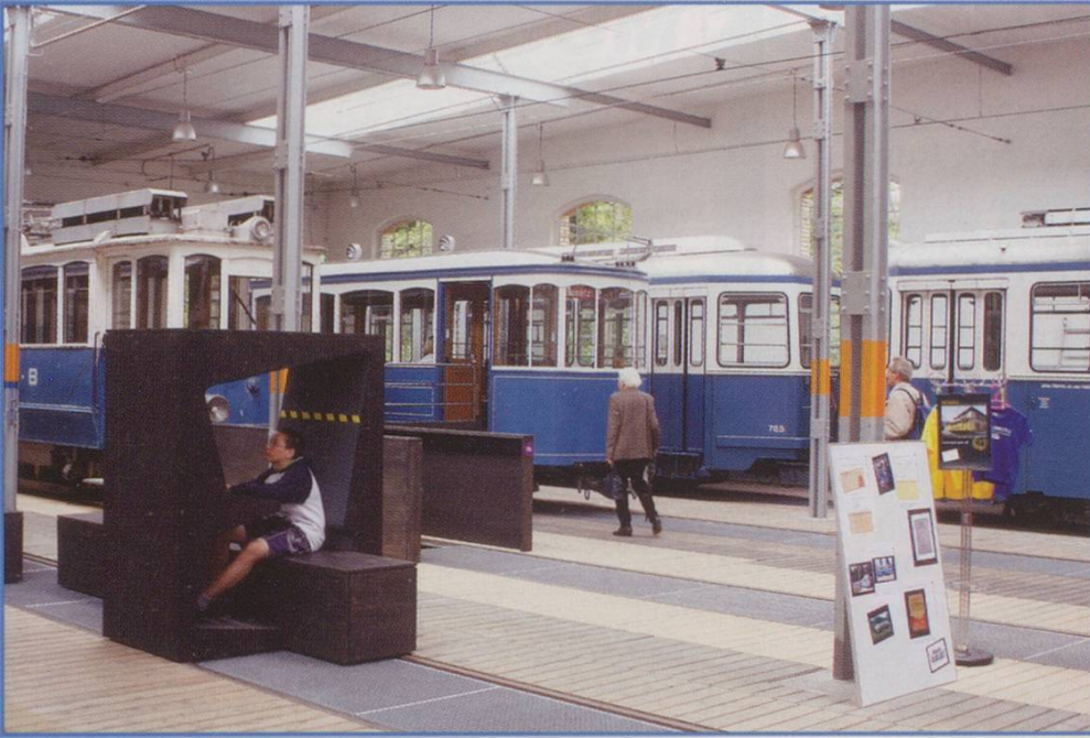
TOP: "Pods" with interactive computer terminals feature amongst the exhibits.