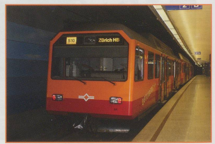
Uetliberg service waiting to leave Platform 2

To go high first you must go low - down to Platform 2 in the basement of the Huptbahnhof. From here the smart, modern, standard gauge EMUs of the SZU (Sihltal Zürich Uetliberg Bahn) climb on Line S10 some 400m to Uetliberg station, some 57m short of the summit of the