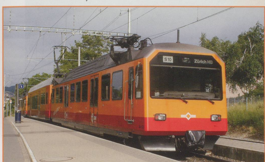
Zürich service at Triemli. Note the offset pantograph

and the collectors on the EMUs, are asymmetrical. The reason that they are offset to one side is that the other line of the SZU, the Sihltalbahn (S4) out to Langnau-Gattikon and Sihlwald, is electrified on the Swiss standard system of 15,000V. The power collection equipment on this line is offset to the opposite side to allow the trains to run on the same tracks where necessary.