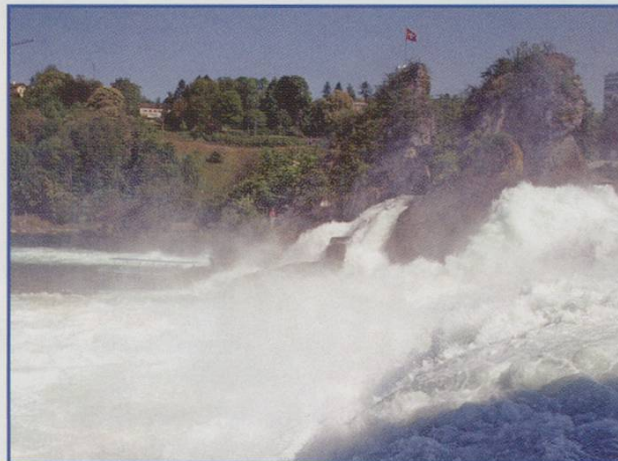
A path climbs from beside the Falls up to Schloss Laufen. Halfway up there is a view across the top of the Falls. In the middle distance is the isolated rock and viewing platform which can be reached by ferry. In the distance a class 526 Turbo train glides past on the Zurich-Schaffhausen line.

Walking through the Schloss gives a brief glimpse of the halt mentioned earlier before one descends to the path which uses the bridge taken by the Winterthur branch to cross the Rhine. On the far side the path descends to the river once more and a whole new series of views of the Falls, this time with Schloss Laufen providing the backdrop. For photographic purposes, it is best to be on this side after midday.