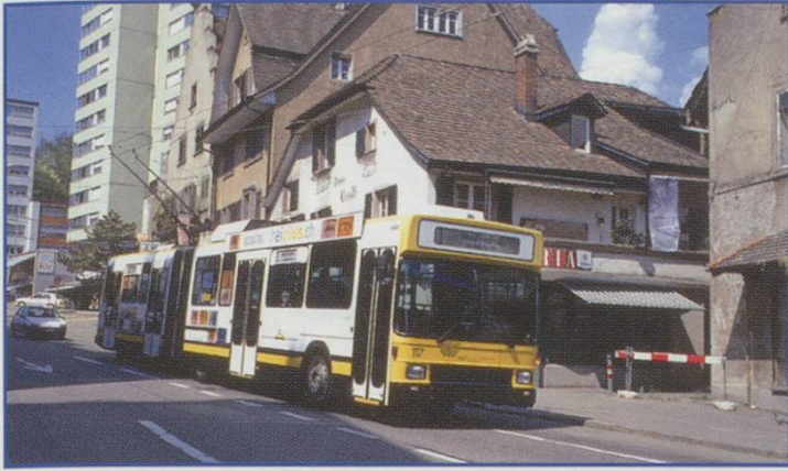
Schaffhausen trolleybus 117 in Neuhausen on Schaffhausen's route 1 from Herbstacker to Waldfriedhof. This route stops outside Schaffhausen station.

way to photograph the Falls in the morning is to go to Winterthur and take the branch train destined for Schaffhausen (hailed by RBe4/4 540034 on the day of our visit in April 2007). From April-October, alight at the little halt Schloss Laufen am Rheinfall and take the short path down to the viewing platform right beside the Falls. The river only drops 23m but the falls are 150m wide and are an incredible sight. Fascinating too is the passenger ferry which crosses the river immediately beneath the falls and provides access through the spray to a viewing point high up on a rock in the middle of the river.