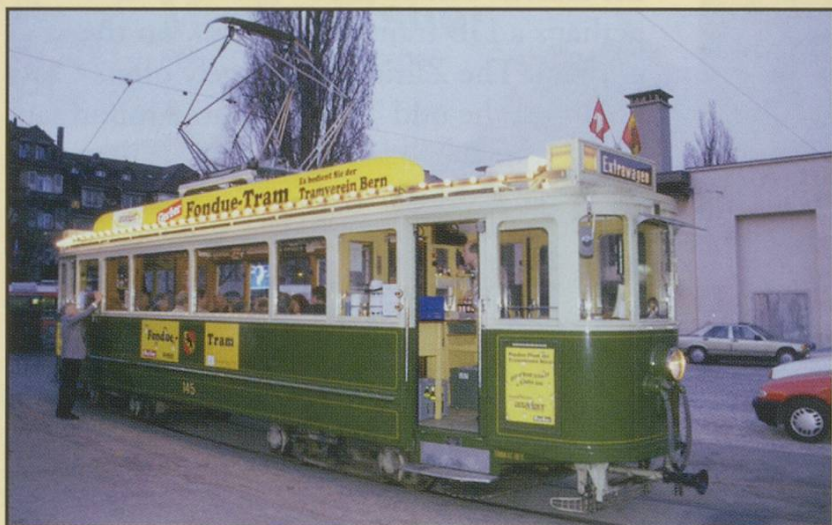
The Fondue tram lit up and full of expectant passengers ready for its journey.