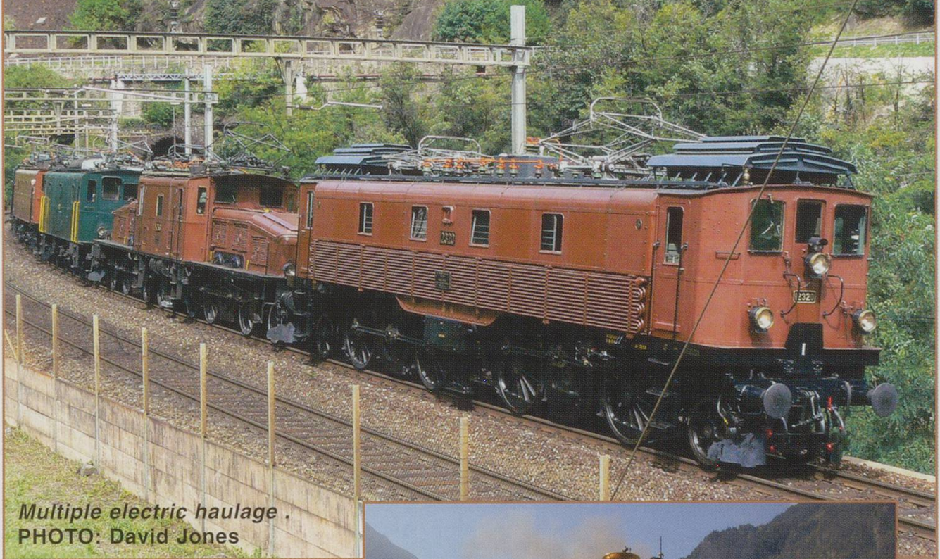
Multiple electric haulage.