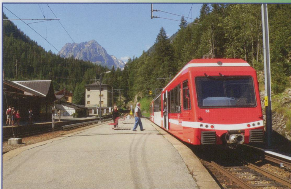
3. MBE No 53 waits at Le Chatelard.