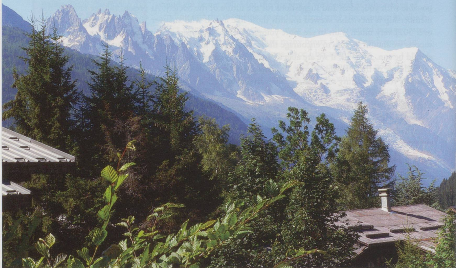
Mont Blanc group from Montroc.