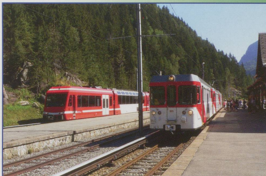
2. Changing trains at Le Chatelard.