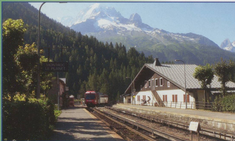
4. A MBE Bdeh 4/8 pulls into Montroc Le Planet on 27/7/07.