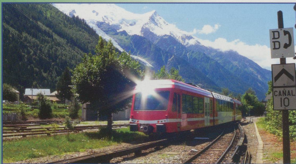
5. The sun glints blindingly from MBE No 53 at Chamonix Station.