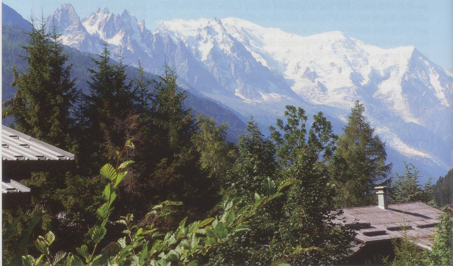
Mont Blanc group from Montroc.