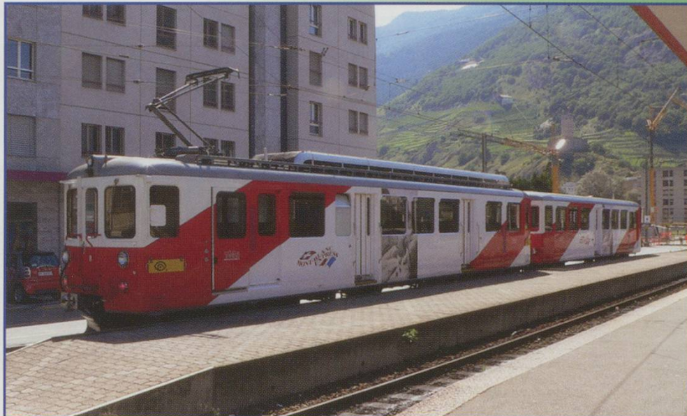
1. MBE Bdeh 4/4 No 8 at Martigny Station with the castle in the background.

After the train enters France there is a long