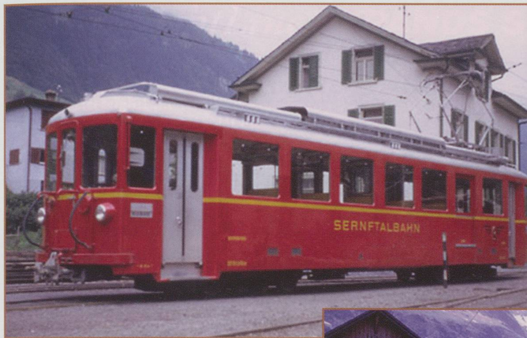
SeTB No. 6 is a CFe 4/4 built by SWS and MFO in 1949 and still at work with the Stern & Hafferl organisation on the Achensee line in Austria. The picture is also taken around 1969 at Elm station. The red livery comes from the colour of the regional arms Glarus/Glaris/Glarona with the Saint Fridolin in black on the red ground.

Following the note in Sidetracks (Dec. Swiss Express ) there is a lot to report on this interesting project. Work has been progressing well, with a hardy band of volunteers working on restoring the old goods shed at Engi. Over 300 man hours have cleaned the accumulated dust and rubbish, and more than 30 kilos of paint has been applied! The museum is well on target to be opened to the public on 18th April 2009. An increasing amount of artefacts, pictures and documents are being accumulated for display. Two of the latest are a diesel engine (still full of oil) from a first generation diesel bus and