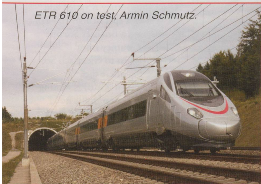
ETR 610 on test, Armin Schmutz.